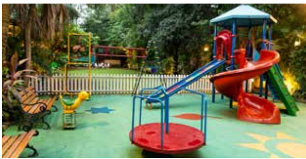
► Kids play area