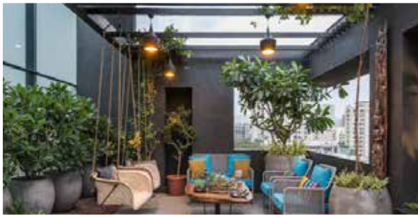
► Terrace Garden

Premium Flats with fantastic Amenities for modern- day life style