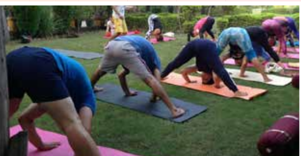
► Dedicated Yoga Lawn