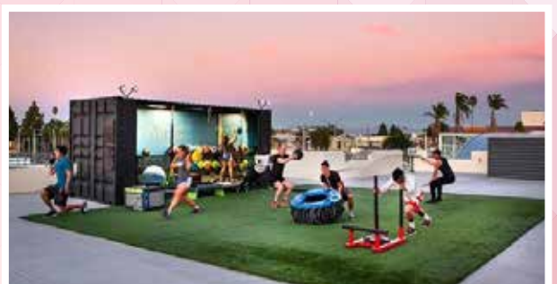
Open Gym ◀