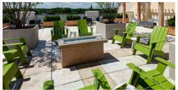
Community Seating Area ◀