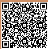
Location QR Code