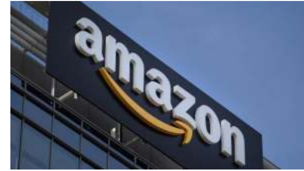
Amazon Data Center