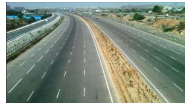
Outer Ring Road