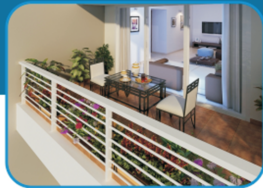
1 BHK ISOMETRIC VIEW