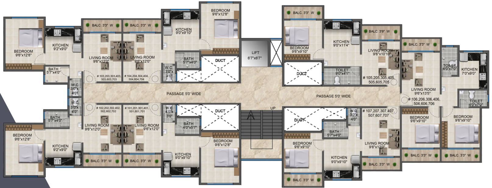
TYPICAL FLOOR PLAN 1ST TO 7TH