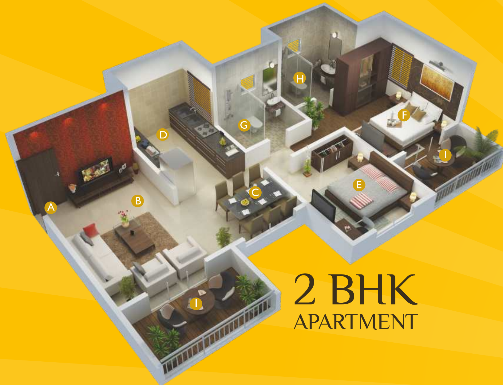
2 BHK APARTMENT