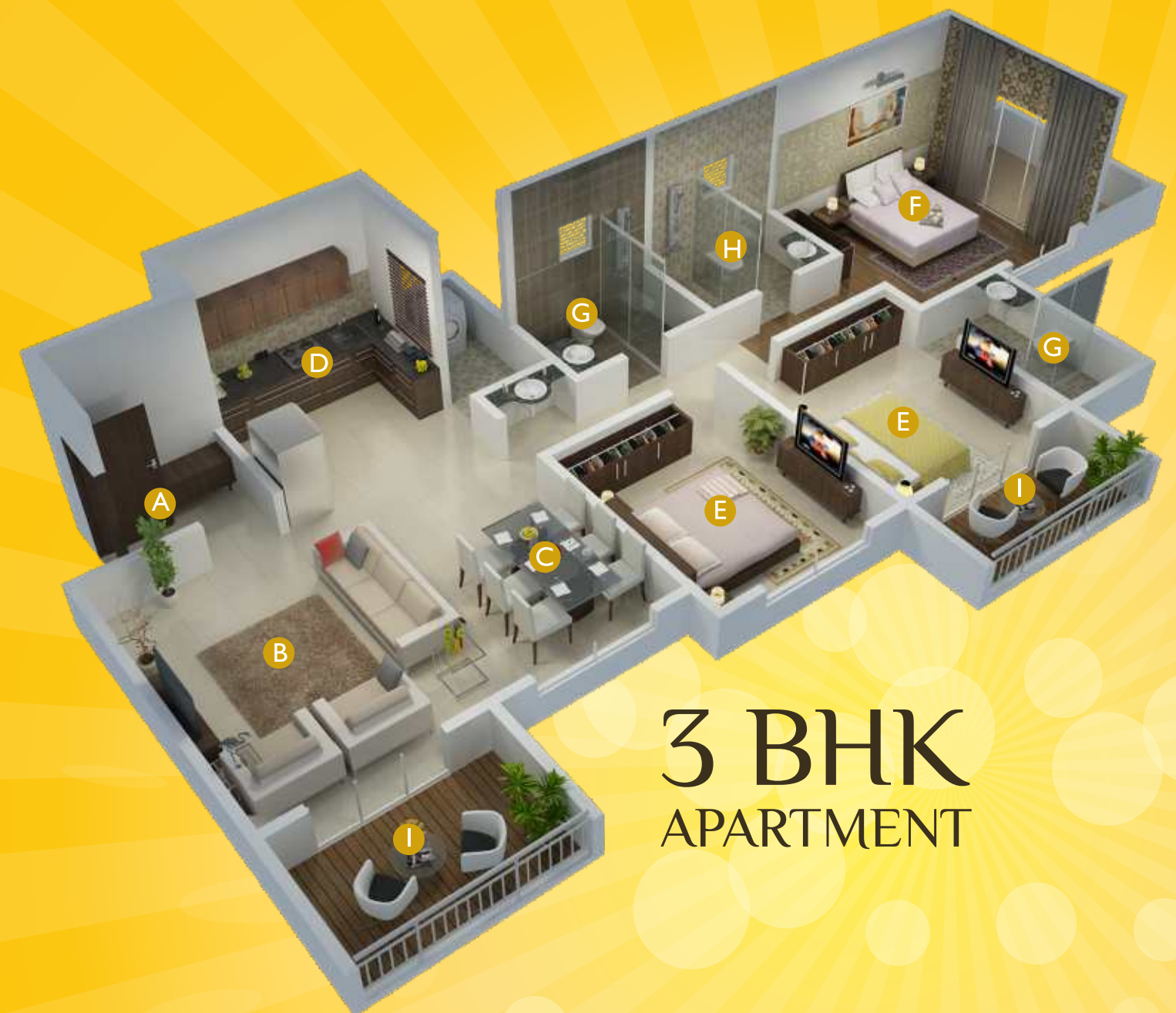
3 BHK APARTMENT