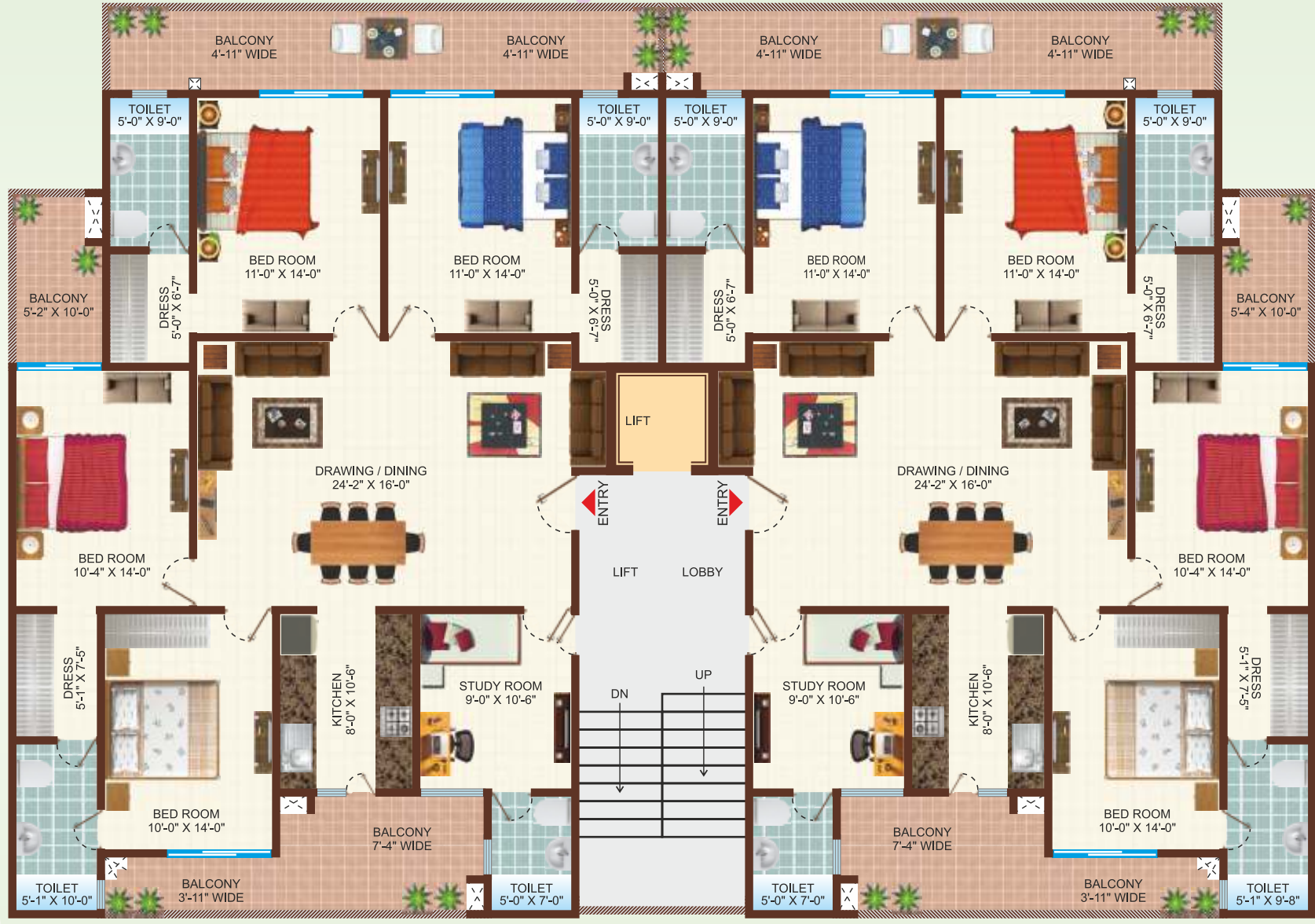
Typical Floor Plan-Floors 1 to 4, Block - A1 to A5, B1 to B2, C1 to C5