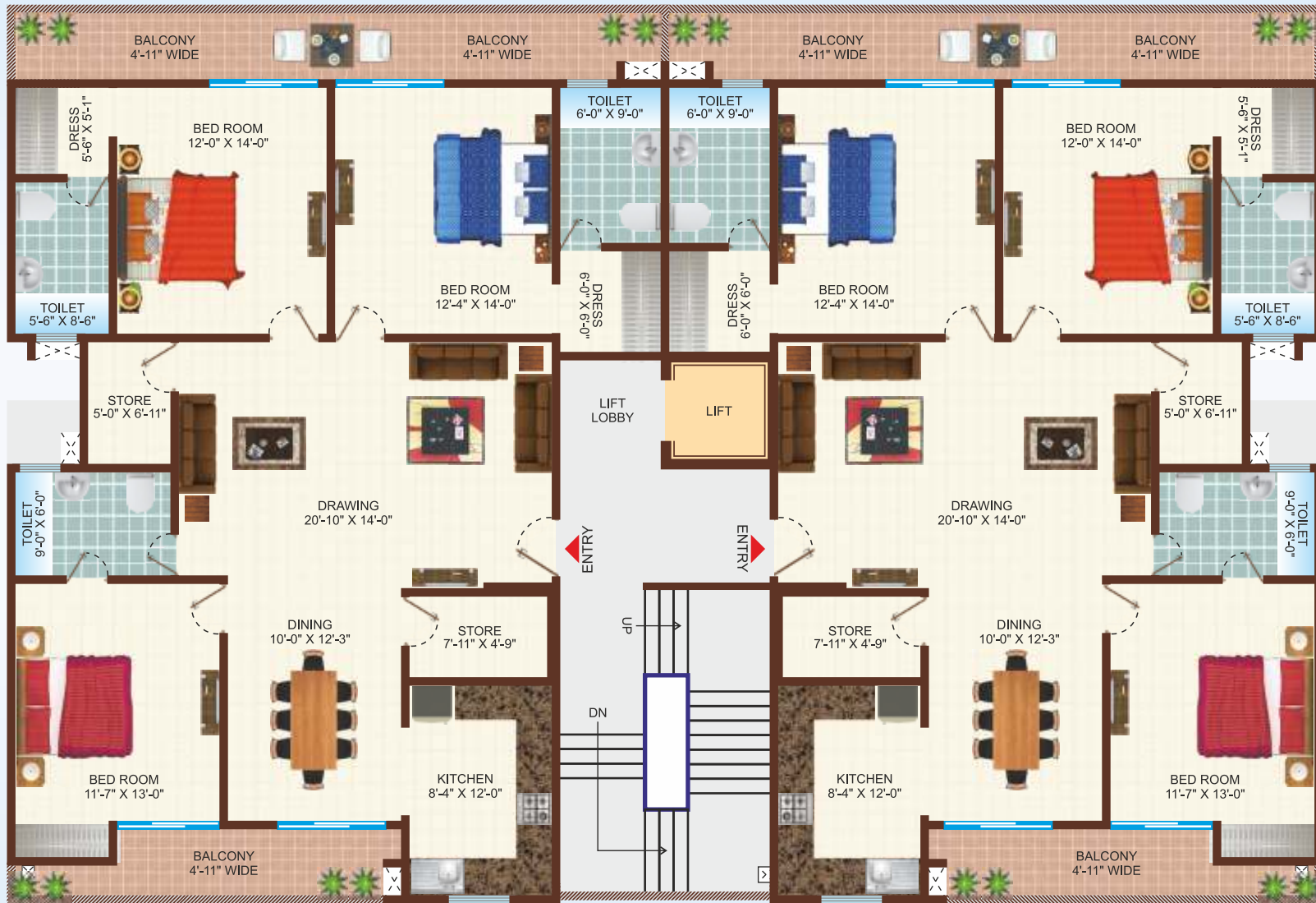
Typical Floor Plan - All Floors, Block D1 to D3