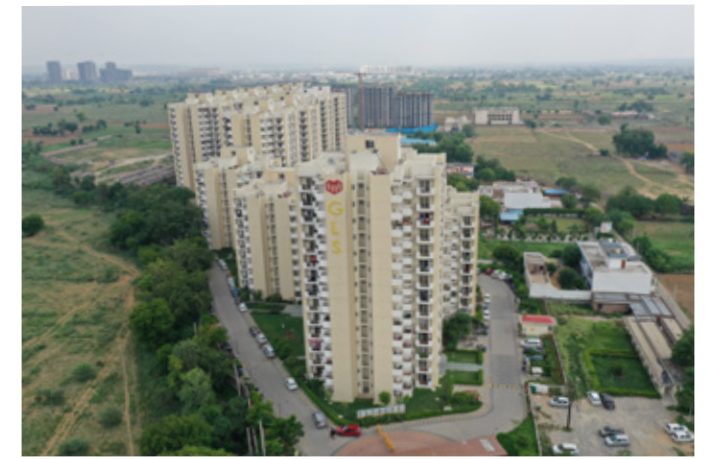
Arawali Homes, Sohna