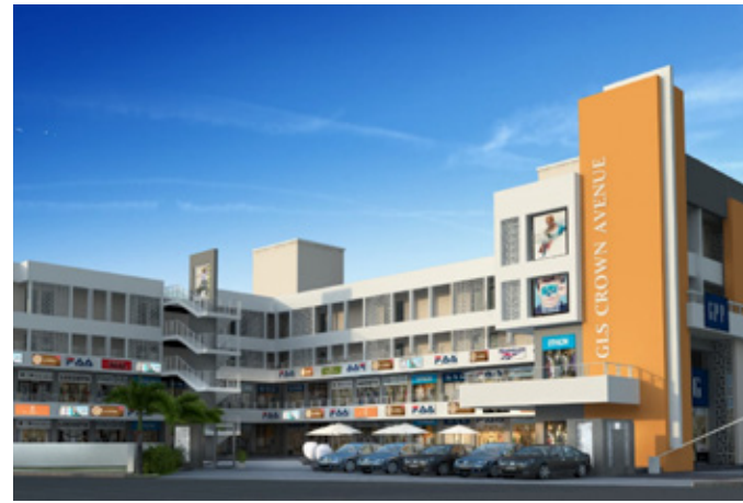
Crown Avenue, Gurgaon