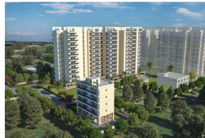
Central Avenue, Gurgaon