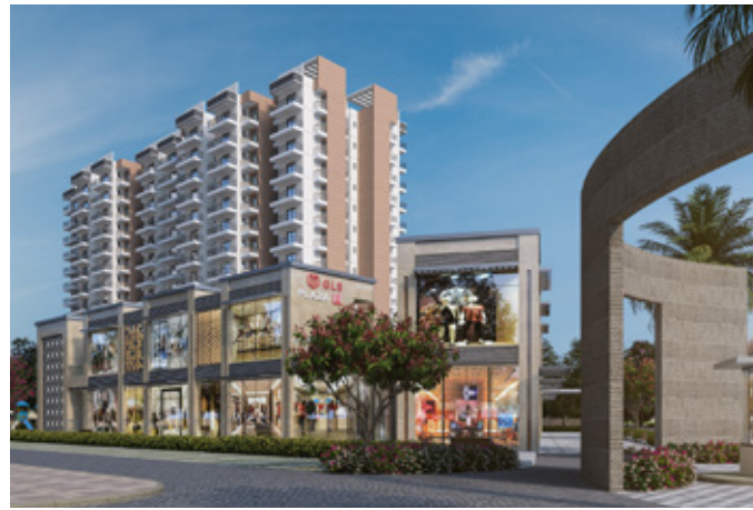
Hub 86, Gurgaon