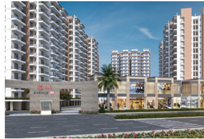
Avenue 86, Gurgaon