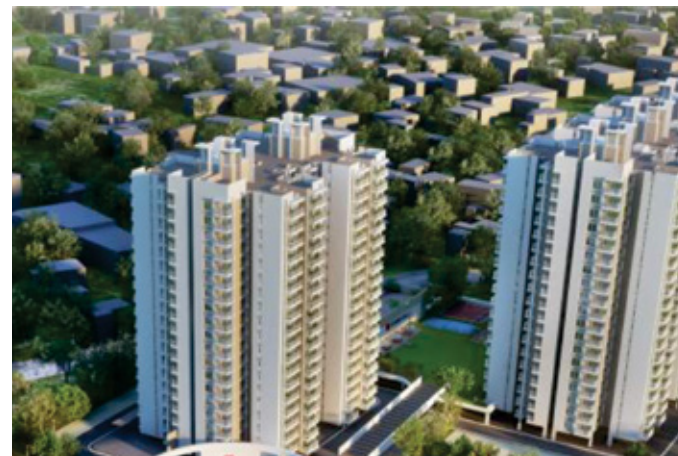
Avenue 81, Gurgaon