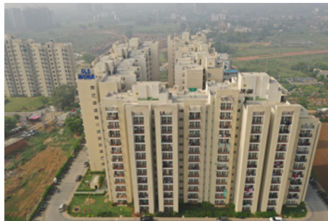
Avenue 51, Gurgaon