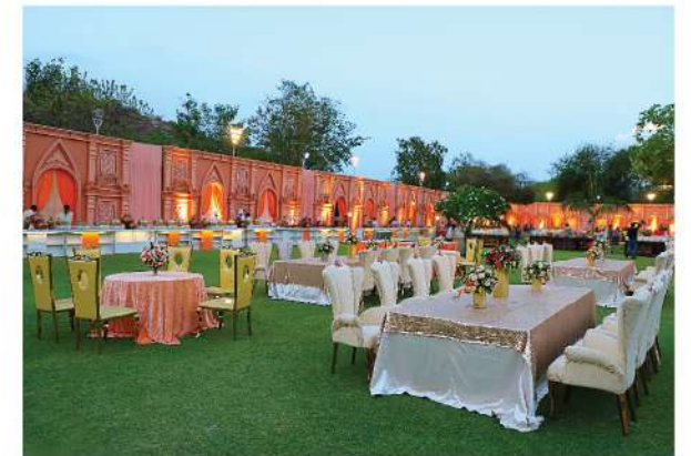
Banquet Hall with Lawn