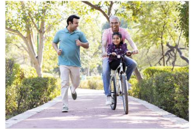
Paved Roads and Sidewalks