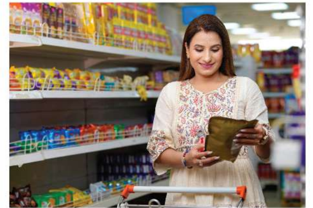
Milk & Vegetable Booth