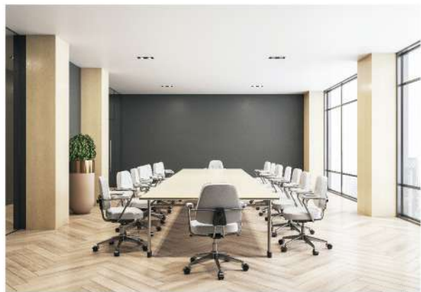
Meeting & Conference Room

The images used above are artistic impression used for representation purpose only.