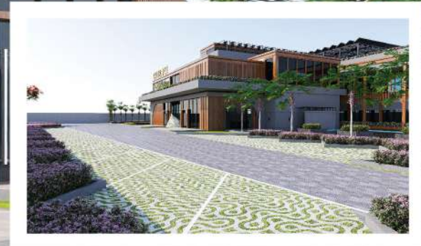
The images used above are artistic impression used for representation purpose only.