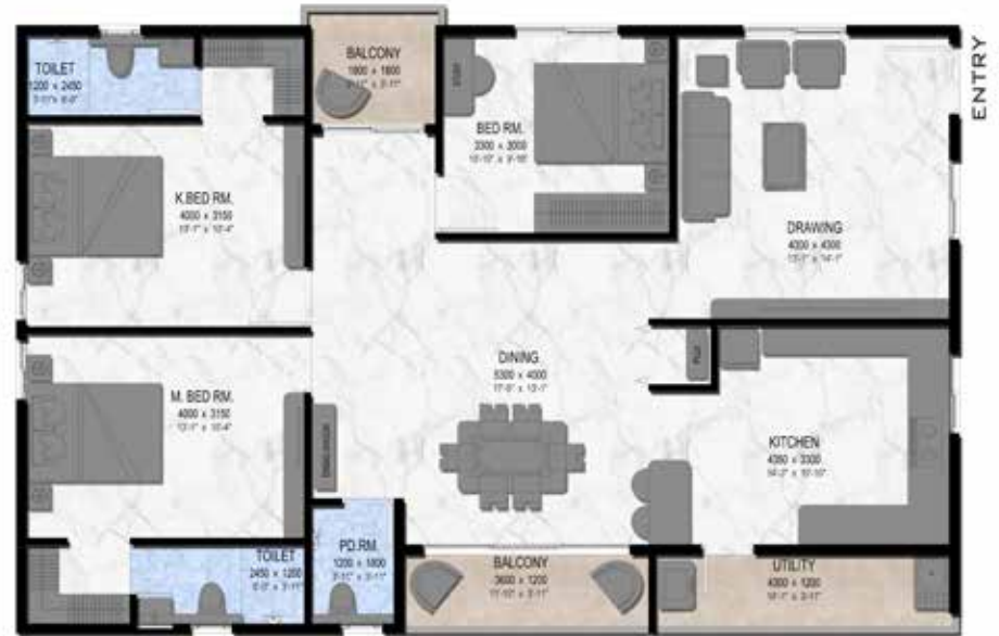
East - 1708 SFT