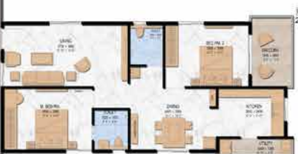
FLAT NO. 5 2 BHK_WF 1198 SFT