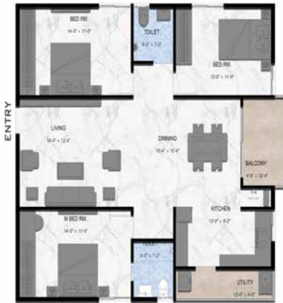
West - 1500 SFT