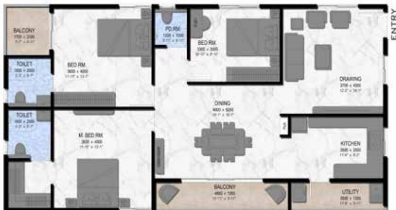
East - 1604 SFT