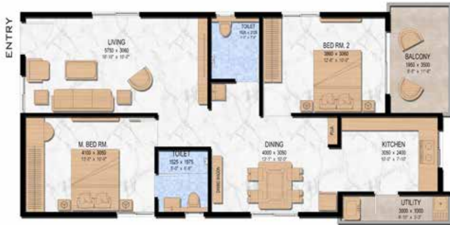
East - 1221 SFT