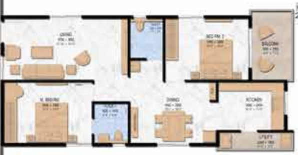
FLAT NO. 4 2 BHK_WF 1283 SFT