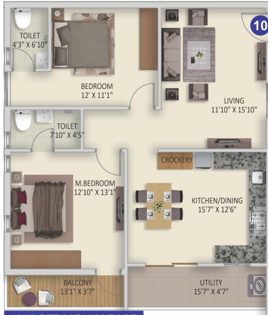
1315 SFT | 2BHK | EAST