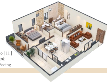
Flat no | 11 | 1225 sft. East Facing