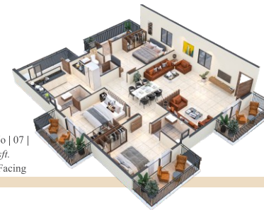
Flat No | 07 | 1975 sft. West Facing