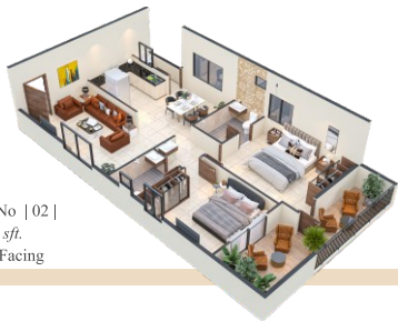
Flat No | 02 | 1315 sft. East Facing