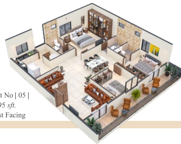
Flat No | 05 | 1695 sft. East Facing