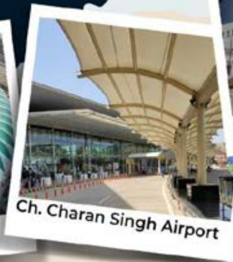
Ch. Charan Singh Airport