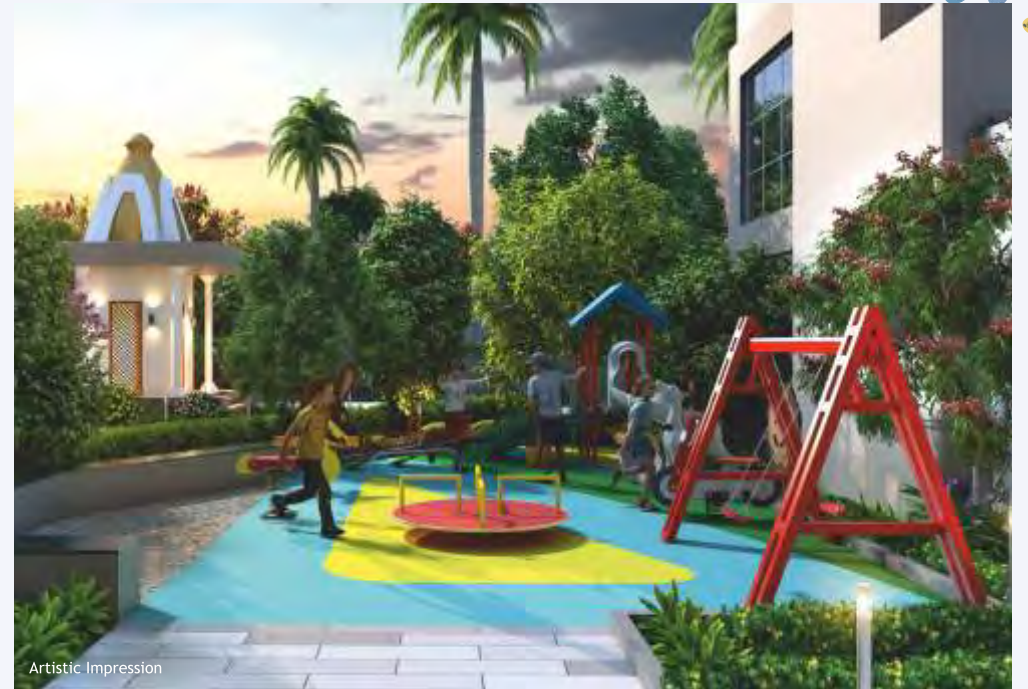
Children's Play Area & Temple