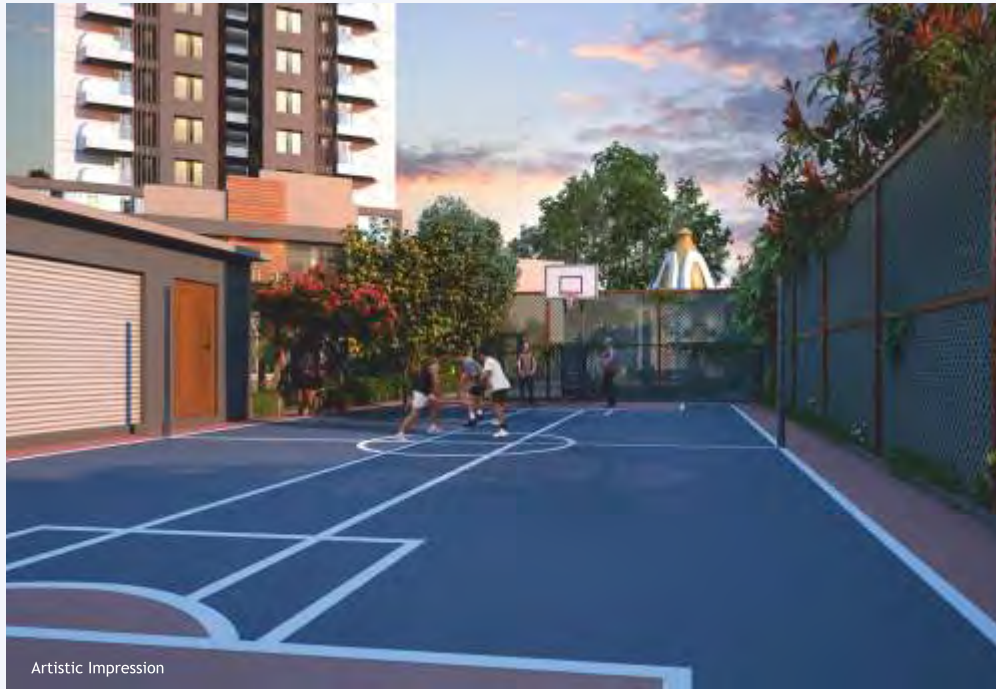
Multipurpose Sports Court