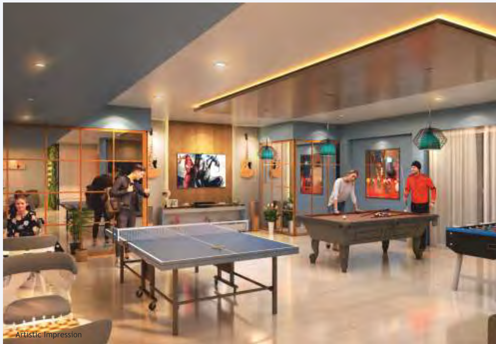
Indoor Games Room