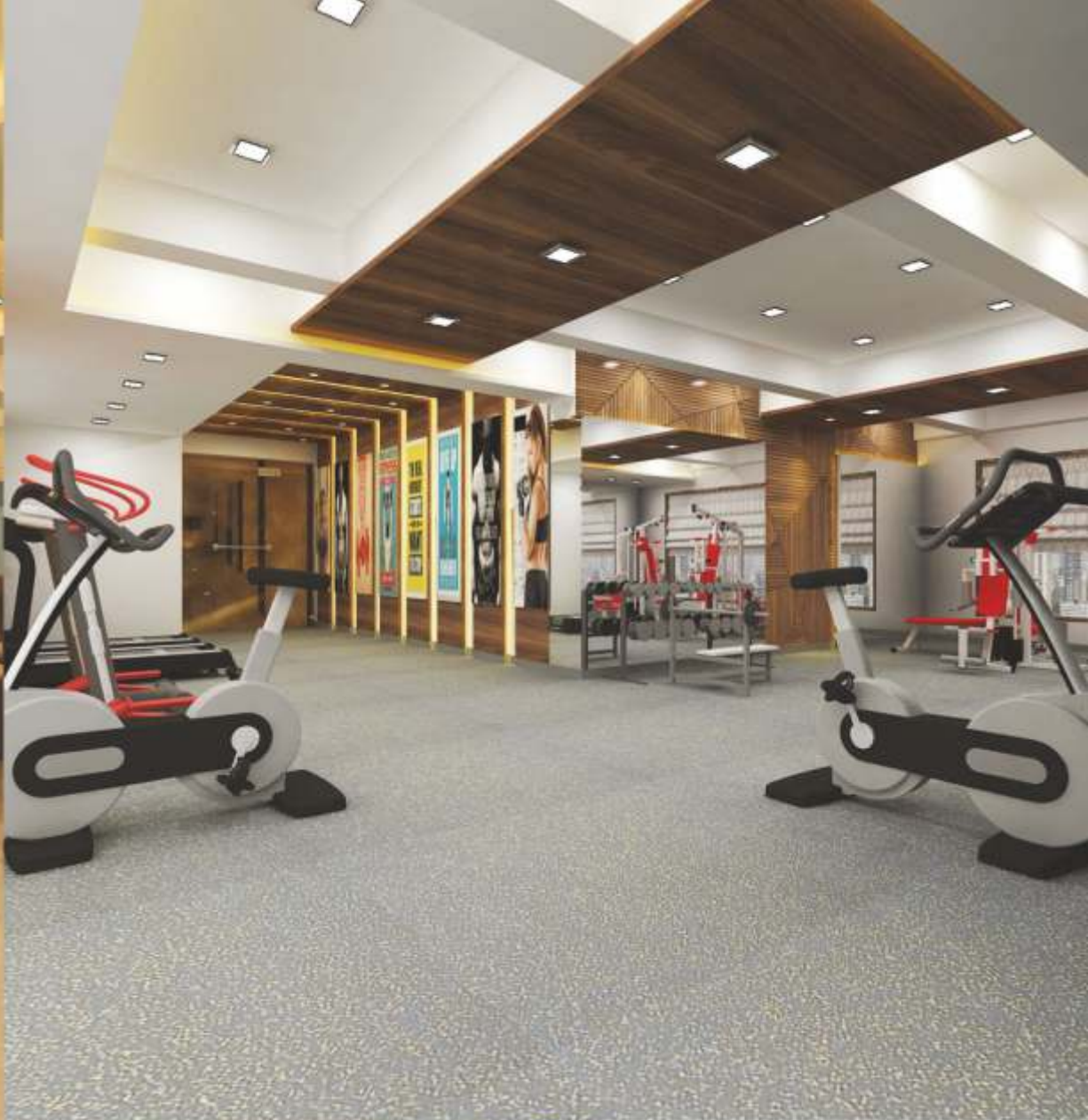
Well Equipped Gymnasium