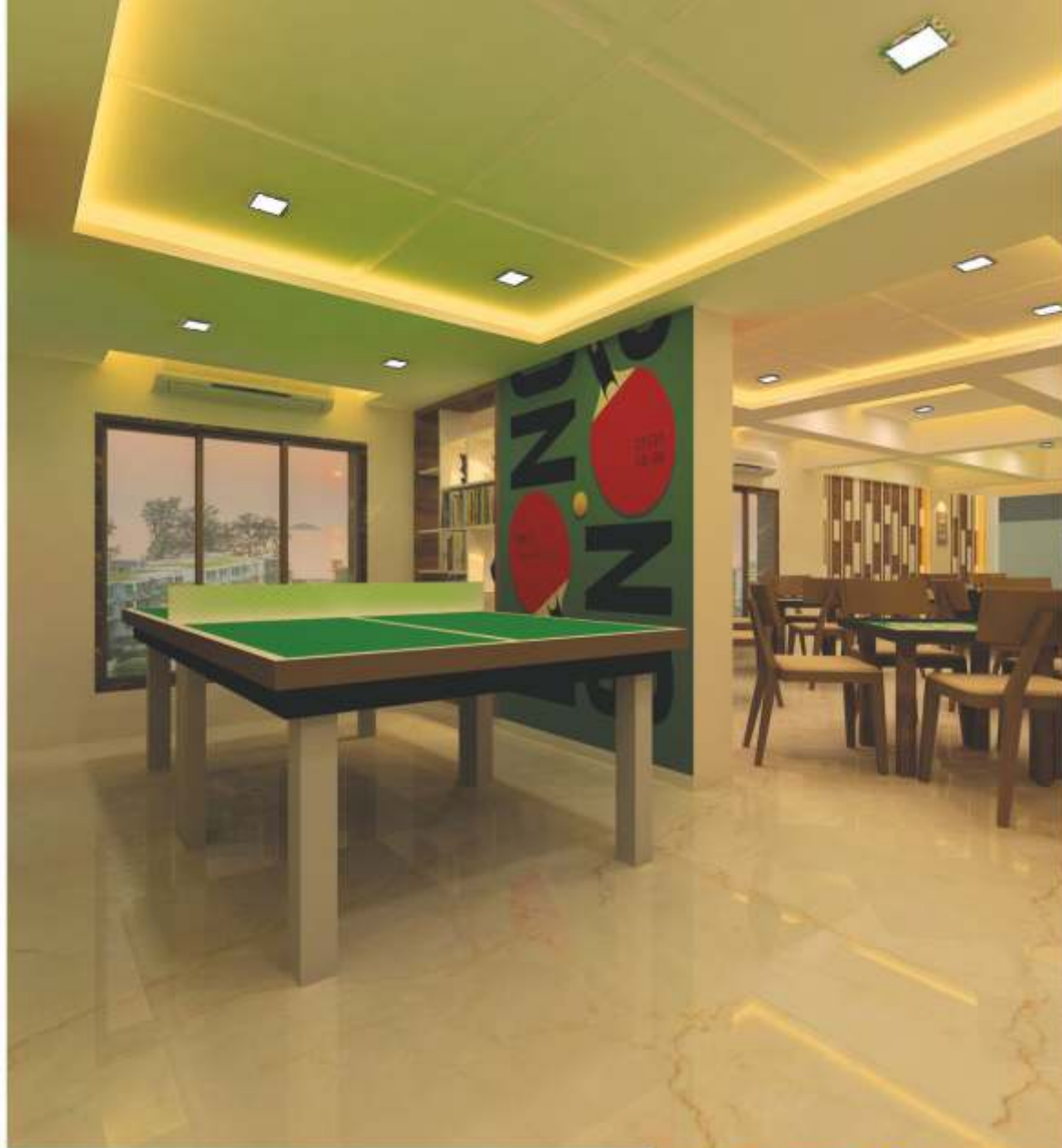
Club House with Indoor Games