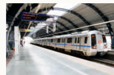
5 min. drive from Metro Station