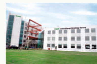
5 min. drive from Fortis Hospital