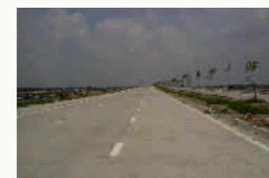
5 min. drive from FNG Expressway