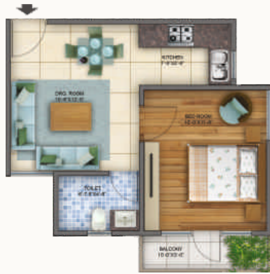
FLOOR PLAN 1BHK 600 sq. ft.