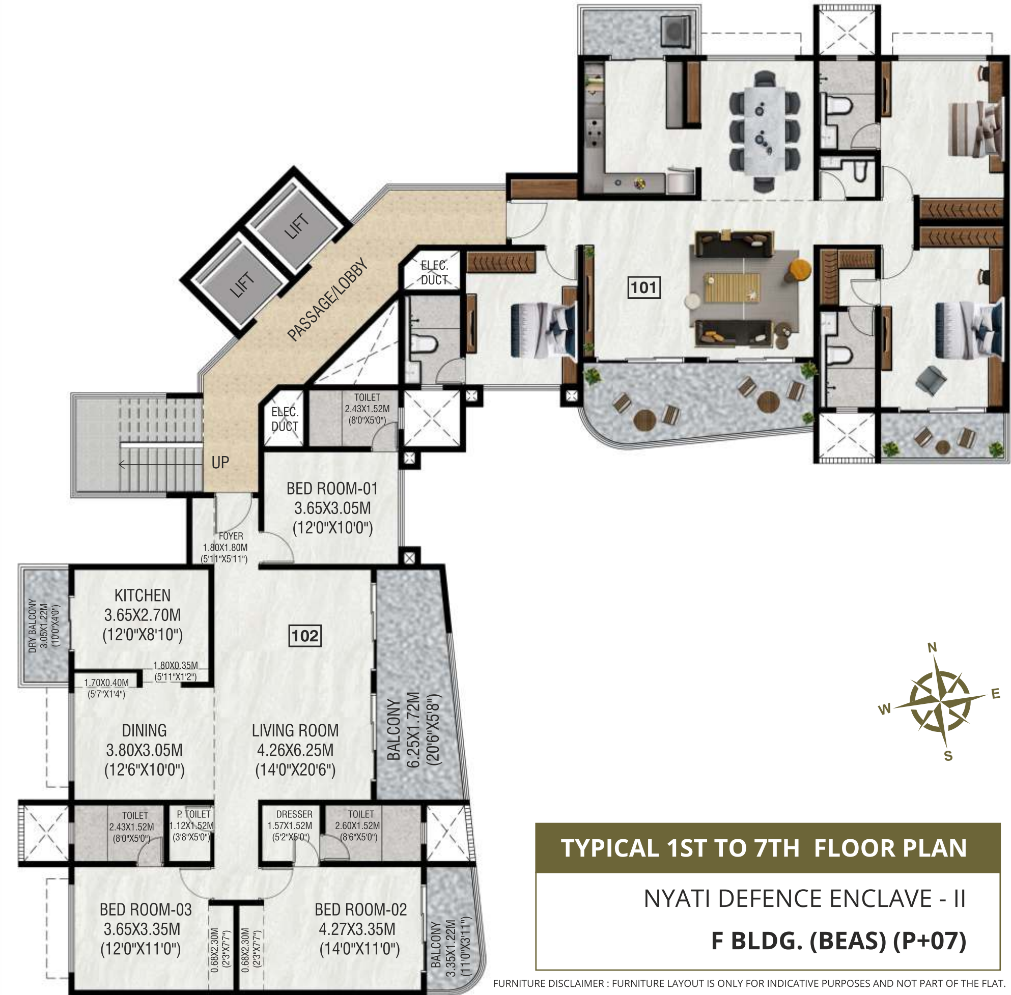
TYPICAL 1ST TO 7TH FLOOR PLAN NYATI DEFENCE ENCLAVE - II F BLDG. (BEAS) (P+07)

FURNITURE DISCLAIMER : FURNITURE LAYOUT IS ONLY FOR INDICATIVE PURPOSES AND NOT PART OF THE FLAT. NOTE : THE DIMENSION OF THE UNIT AS MENTIONED ARE FROM "BARE WALL" TO "BARE WALL"