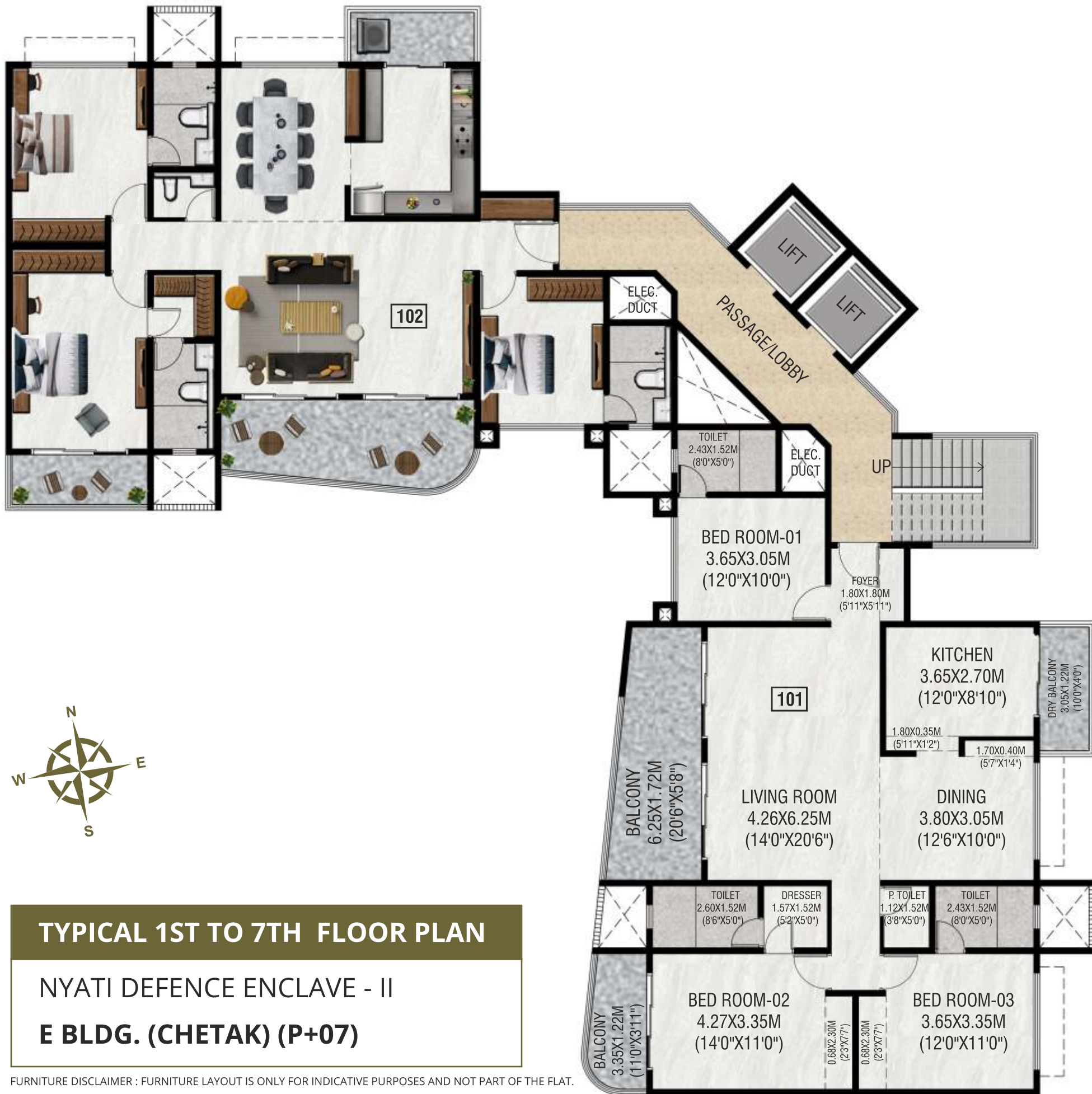
TYPICAL 1ST TO 7TH FLOOR PLAN NYATI DEFENCE ENCLAVE - II E BLDG. (CHETAK) (P+07)

FURNITURE DISCLAIMER : FURNITURE LAYOUT IS ONLY FOR INDICATIVE PURPOSES AND NOT PART OF THE FLAT. NOTE : THE DIMENSION OF THE UNIT AS MENTIONED ARE FROM "BARE WALL" TO "BARE WALL"