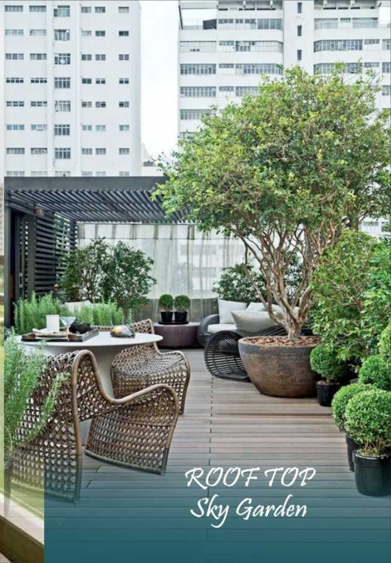
ROOF TOP Sky Garden