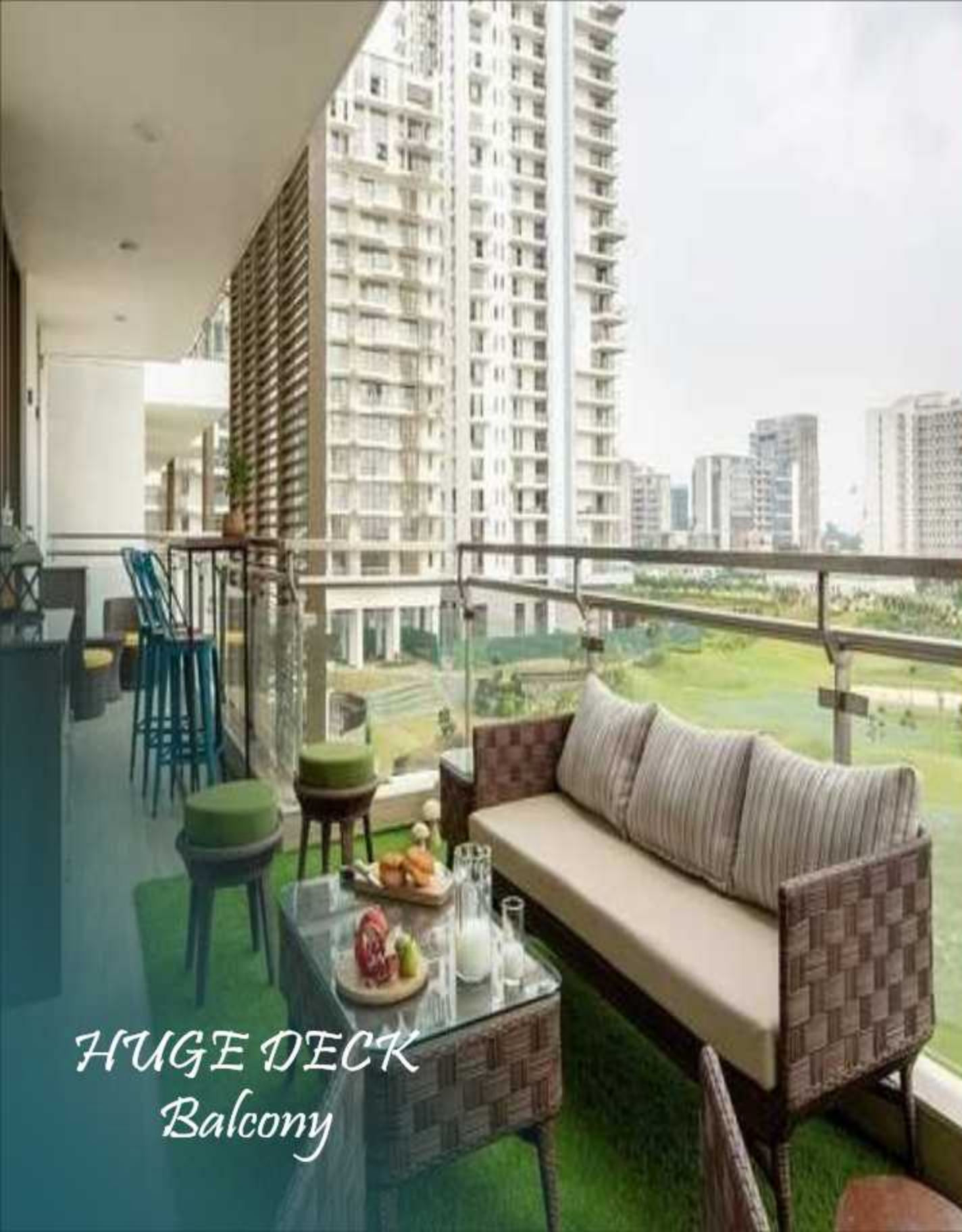
HUGE DECK Balcony