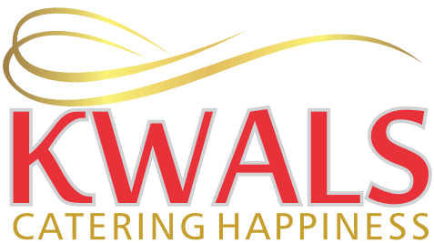
Food Court Partner

Chai Point, Tea Nation, Giani’s, Cream Bell, Kwalty Walls, Nirulas, King’s Kulfi, Moti Mahal, Veda, Nirvana, Sanskriti, Amritsari Express, Nizam, Nazeer, Kebab Express, Shri Ratnam, Sagar Ratna, Vaango, Madras Café, Yo! China, Baker Point, Mr. Brown, Pizza Hut, Mad Over Donuts, Bikano, Taco Bell