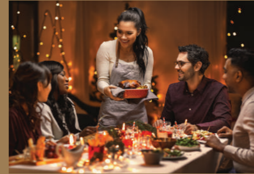
IN-HOUSE DINING HALL WITH ALL INDIAN CUISINE