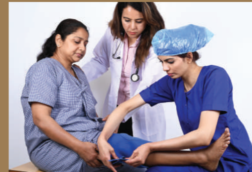
24X7 MEDICAL ASSISTANCE