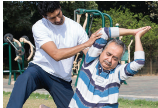
ENGAGING PHYSICAL ACTIVITIES