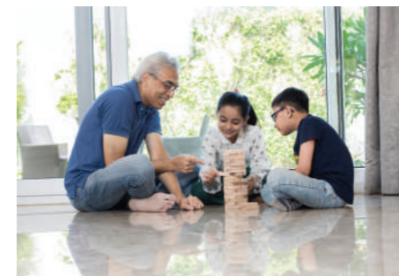
Generational barriers are broken