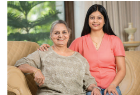
Care & affection reside