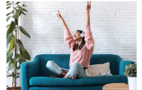
Satisfaction echoes in every corner