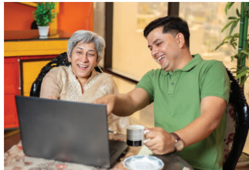
ACCOMPANYING YOUR SENIORS IN THE COMFORT OF YOUR HOME

Togetherness grows when things get taken care of without any hassles. Primus ensures absolute freedom from worries, chores, cooking, or daily errands. Be it tea at your table when you want or whenever your elders need any medication when you are away. Everything is taken care of in a professional way.