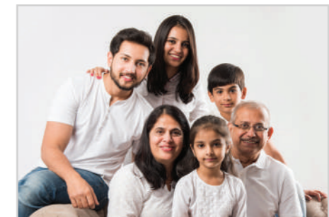
Life begins and affection never ends