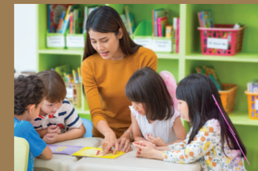
DAY CARE CENTER