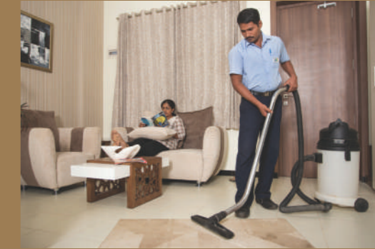
PROFESSIONAL HOME MAINTAINANCE