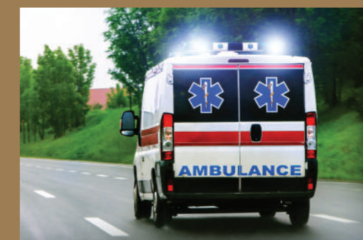
AMBULANCE ON CAMPUS