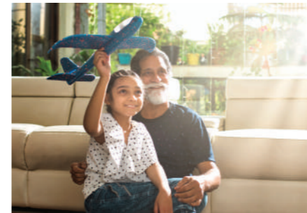
Happy times are unscripted