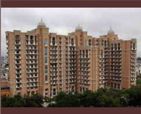
PURVANCHAL KINGS COURT Gomti Nagar, Lucknow

Take a look at some of our breathtaking projects that laid the foundation for a better lifestyle in Noida, Greater Noida, and Lucknow.