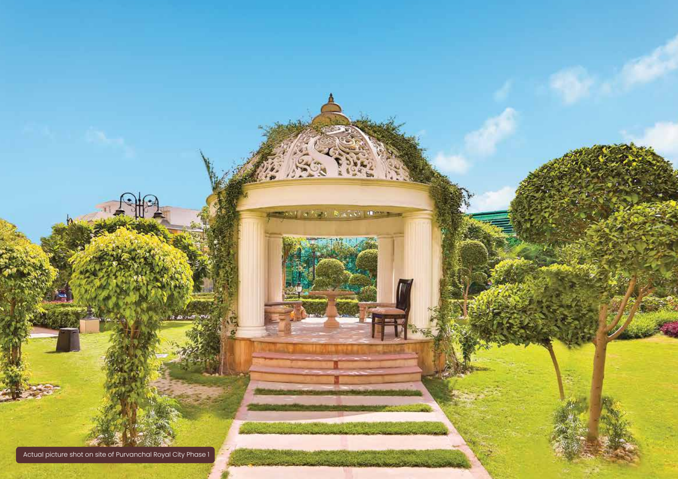
Actual picture shot on site of Purvanchal Royal City Phase 1