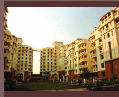
PURVANCHAL SILVER ESTATE Sector-50, Noida