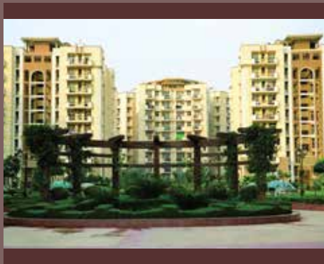
PURVANCHAL SILVER CITY II Sector Pi II, Greater Noida