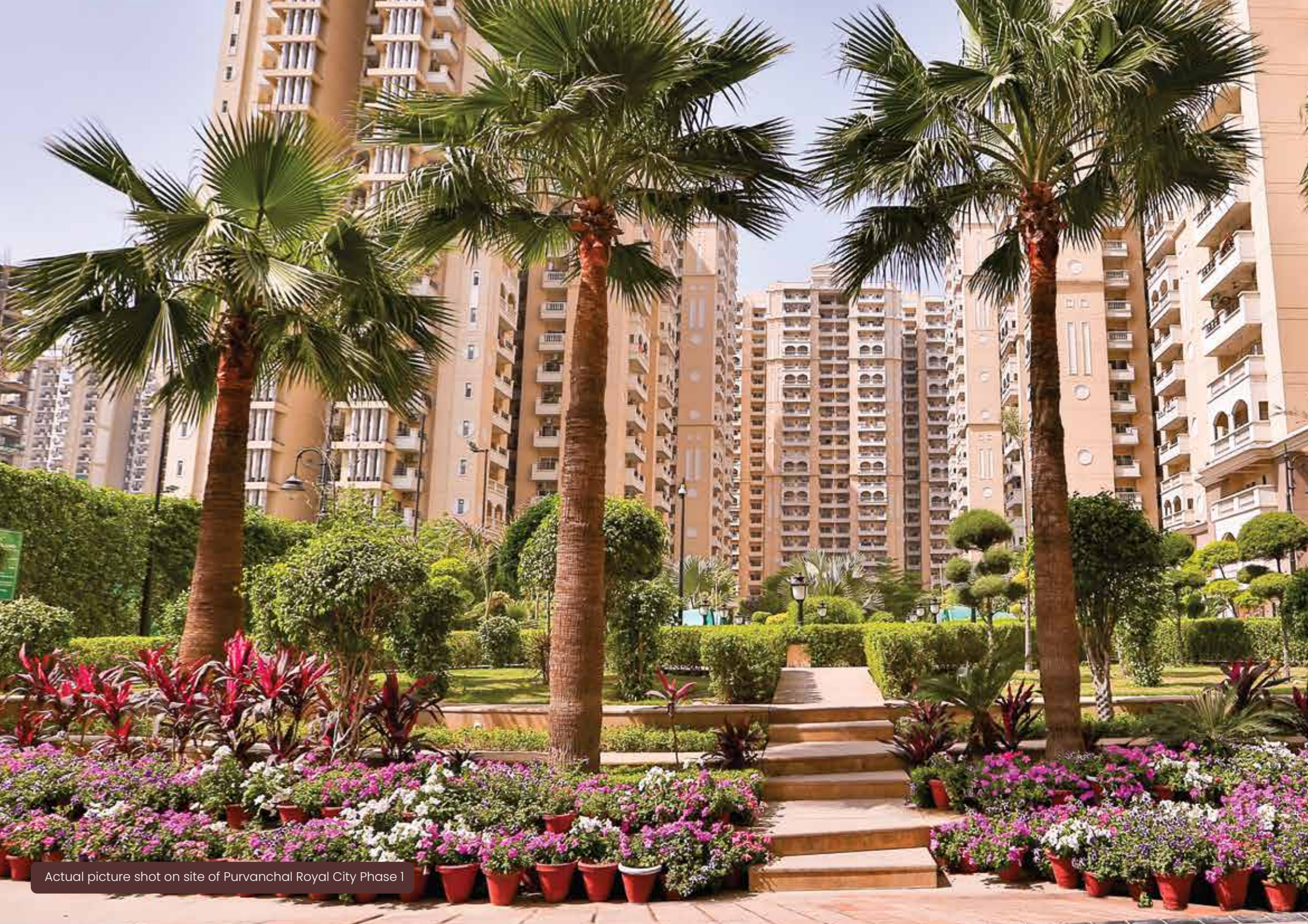
Actual picture shot on site of Purvanchal Royal City Phase 1