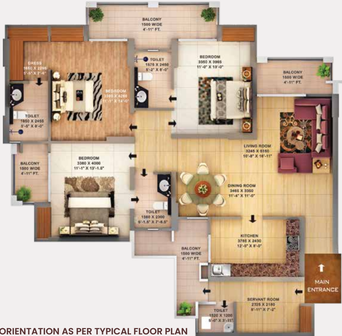
UNIT ORIENTATION AS PER TYPICAL FLOOR PLAN