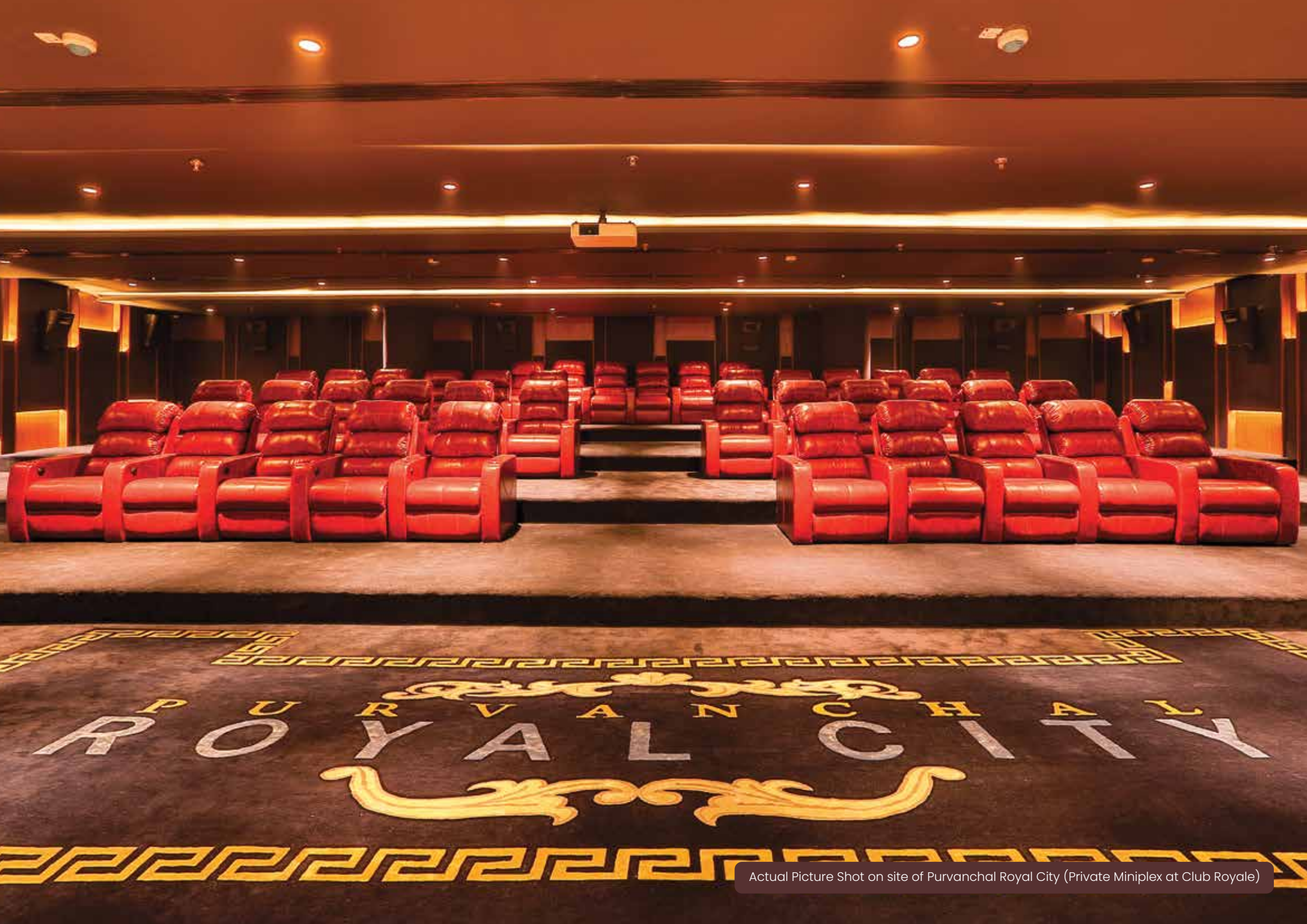
Actual Picture Shot on site of Purvanchal Royal City (Private Miniplex at Club Royale)