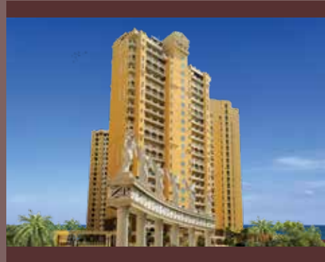
PURVANCHAL ROYAL CITY PHASE I Sector CHI-V, Greater Noida