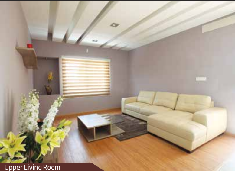
Upper Living Room