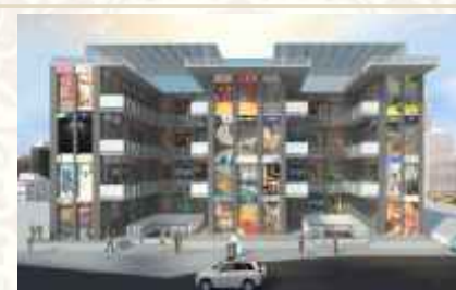
Delta City Centre SHOPPING CENTER

Located at Knowledge Park I, Greater Noida