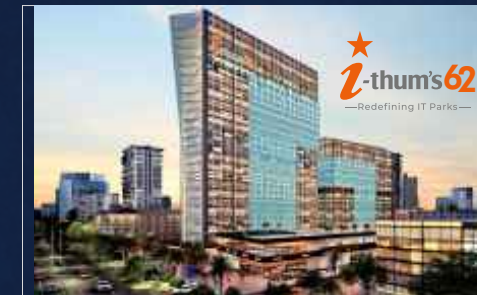
Sector 62, Noida