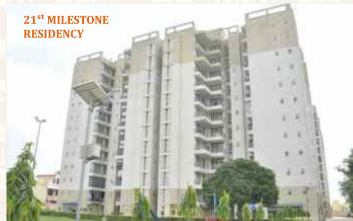
Rajnagar Ghaziabad | 2 & 3 BHK Apartments