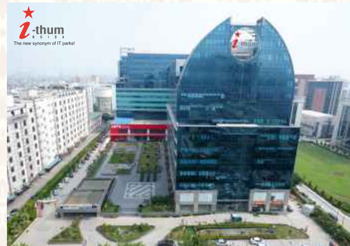
IT/ITeS / COMMERCIAL | Sector 62, Noida