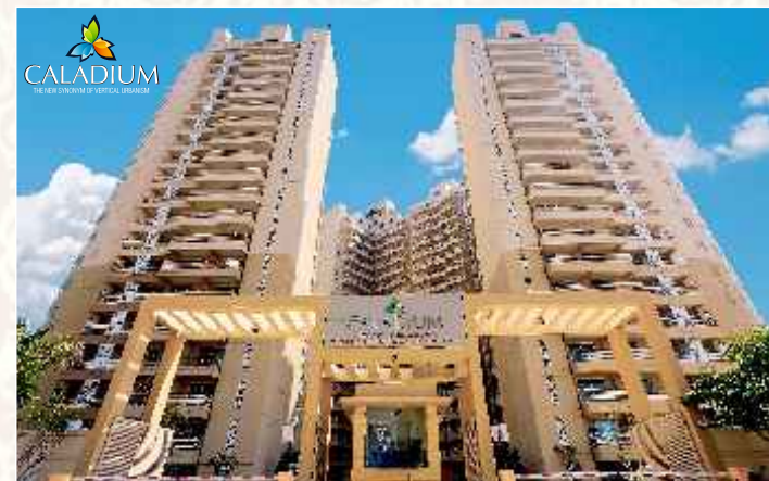
Sector 109, Gurugram | 3 & 4 BHK Apartments & Penthouses