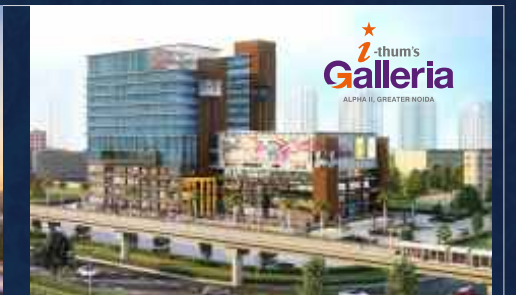
Alpha II, Greater Noida