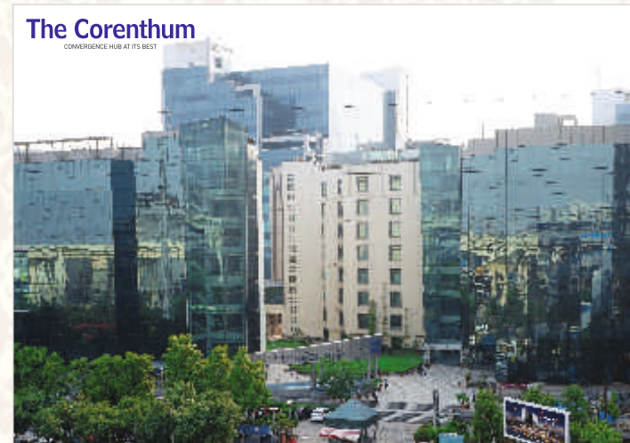
CORPORATE PARK | Sector 62, Noida