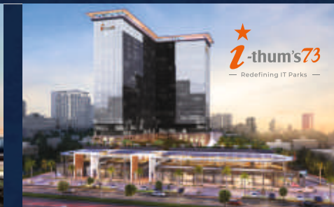
Sector 73, Noida