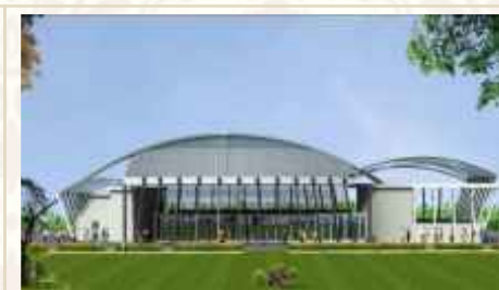
Ice Skating Rink & Indoor Stadium STADIUM

Located at Sector Delta-1, Greater Noida