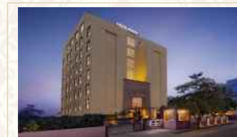
The Hideaway HOTEL

Located at Knowledge Park I, Greater Noida