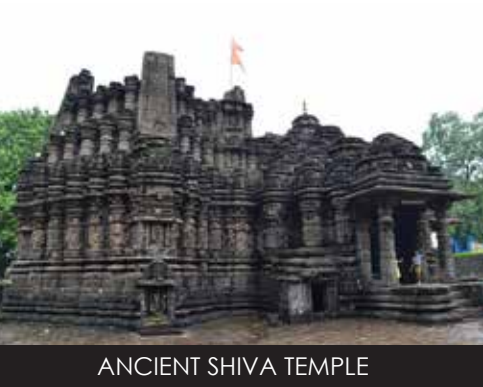
ANCIENT SHIVA TEMPLE