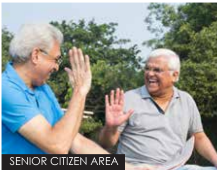
SENIOR CITIZEN AREA