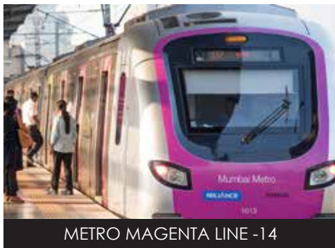
METRO MAGENTA LINE -14