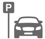
AMPLE CAR PARKING