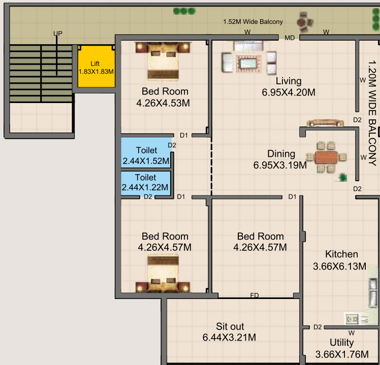
3496 Sft West Facing Flat