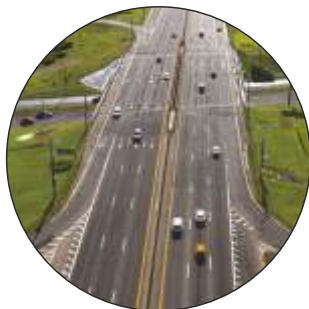
Dwarka Expressway Property