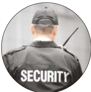
24 Hours Hi-Tech Security