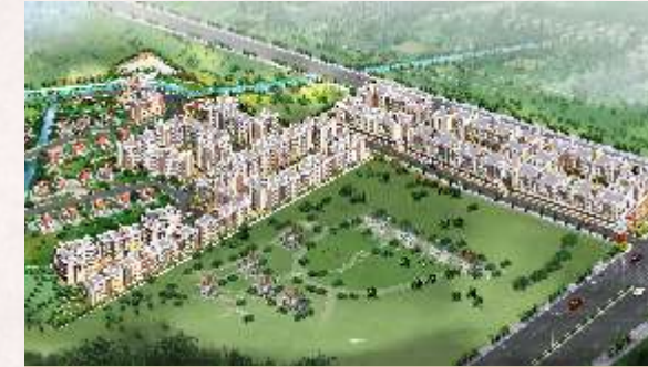
OSTWAL WONDER CITY (Boisar - East)