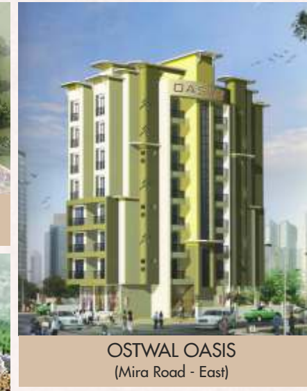
OSTWAL OASIS (Mira Road - East)