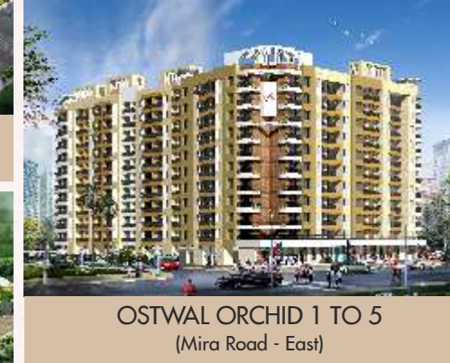
OSTWAL ORCHID 1 TO 5 (Mira Road - East)