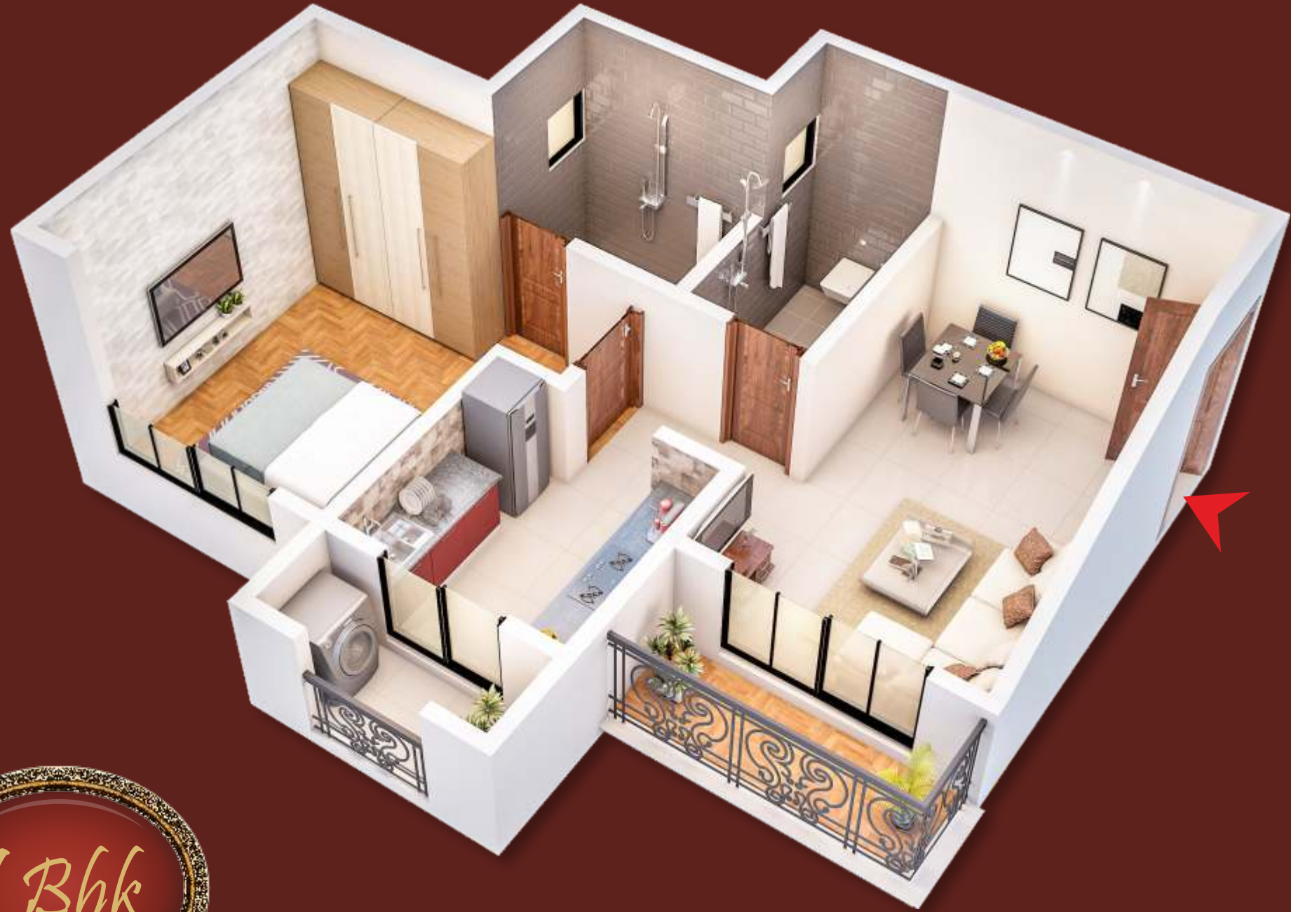
1 Bhk ISOMETRIC VIEW