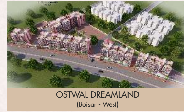
OSTWAL DREAMLAND (Boisar - West)