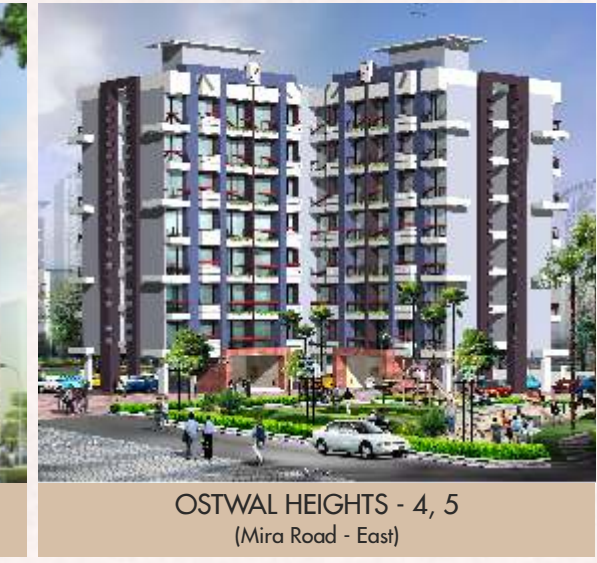
OSTWAL HEIGHTS - 4, 5 (Mira Road - East)