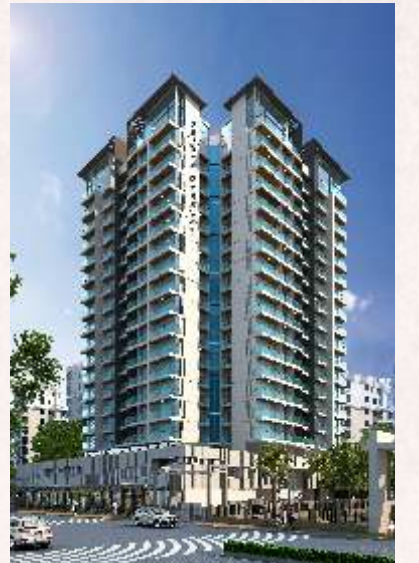
OSTWAL DARSHAN (Bhayandar - East)