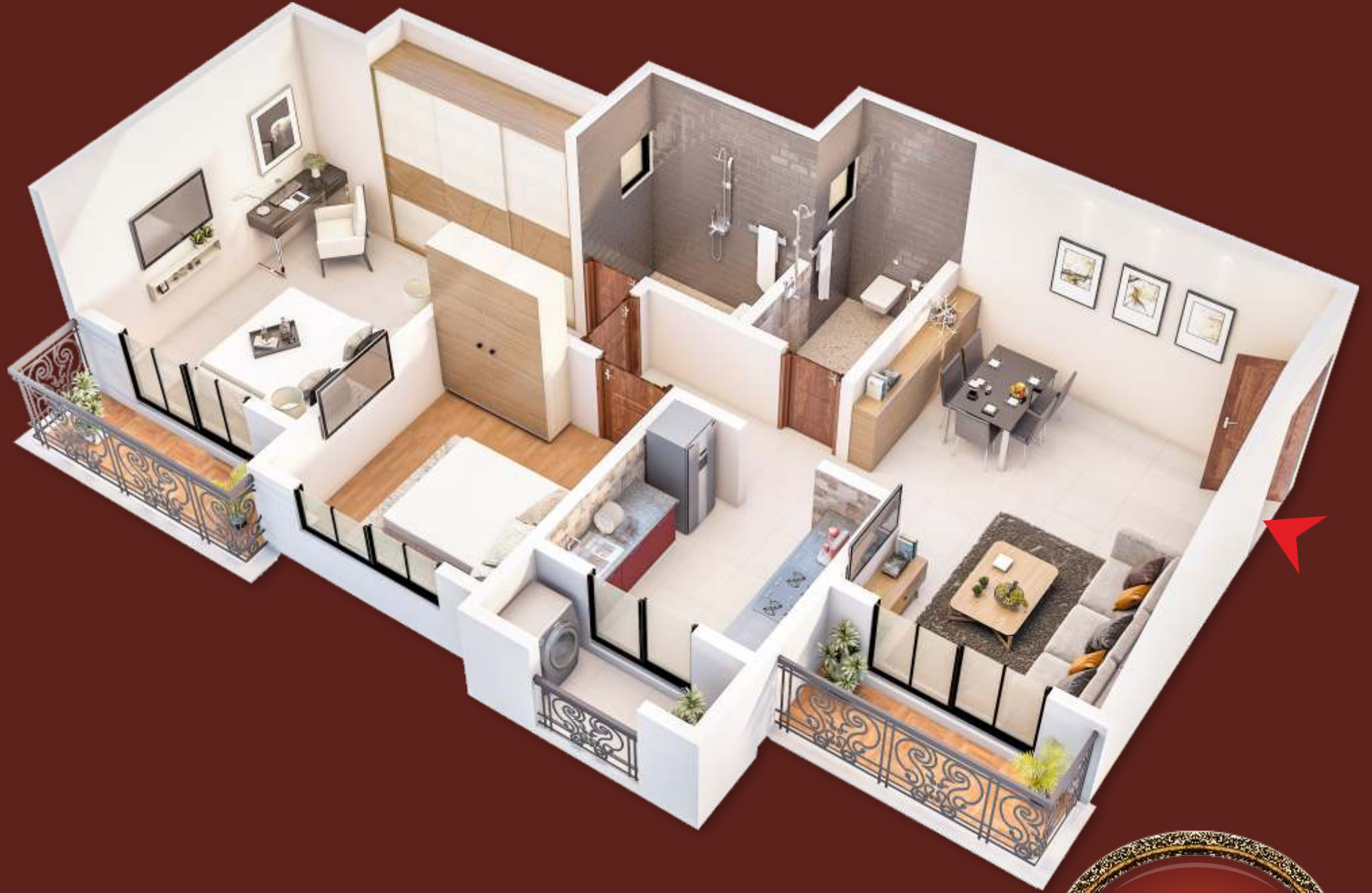
2 Bhk ISOMETRIC VIEW