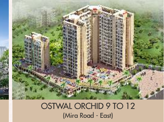
OSTWAL ORCHID 9 TO 12 (Mira Road - East)