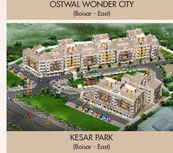
KESAR PARK (Boisar - East)