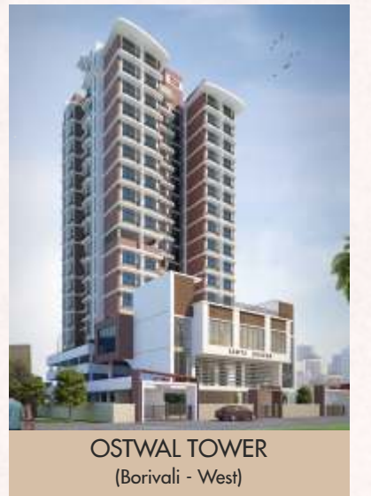
OSTWAL TOWER (Borivali - West)