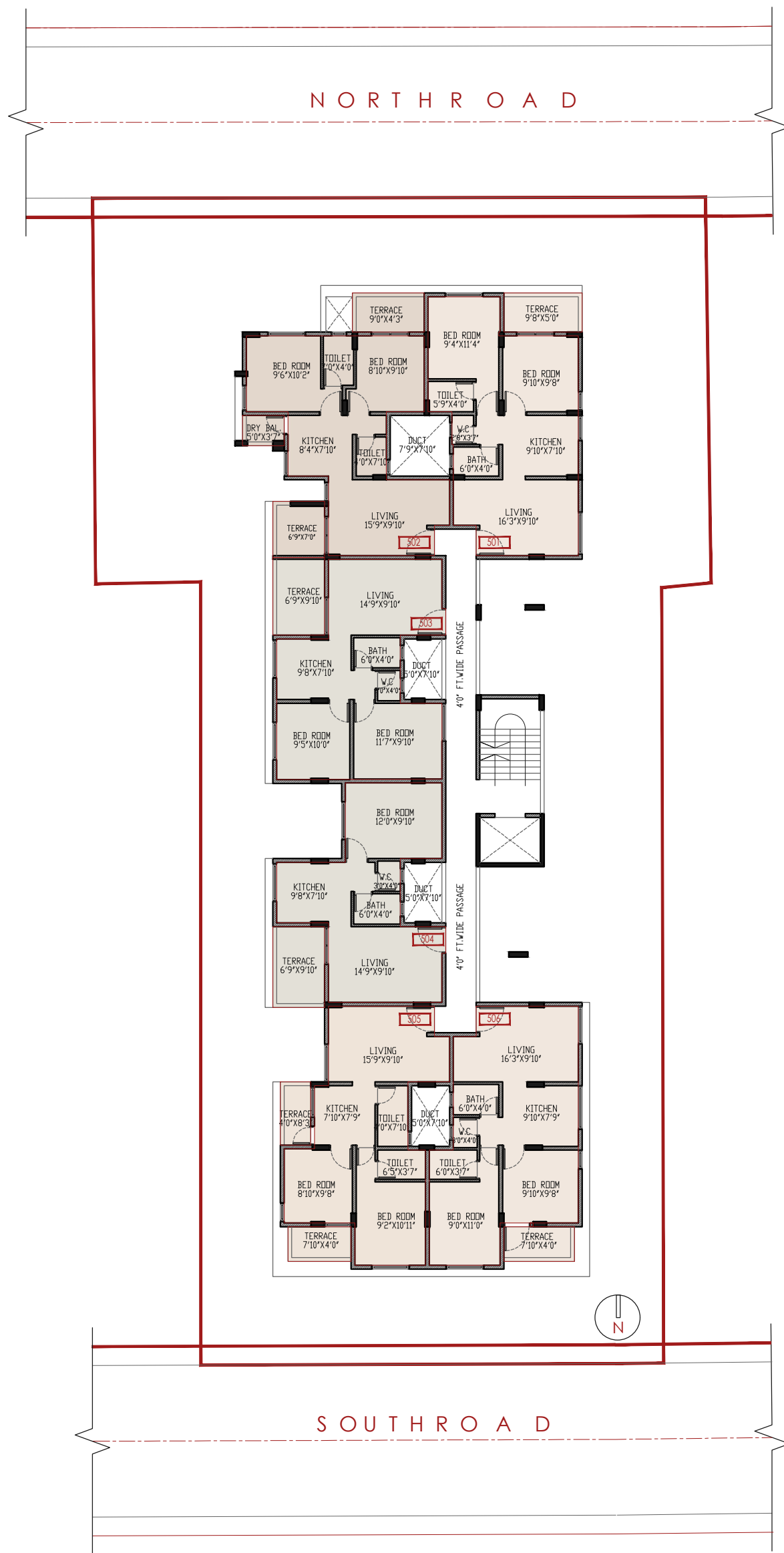
5TH FLOOR PLAN