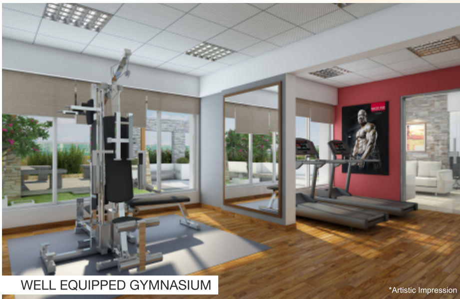
WELL EQUIPPED GYMNASIUM