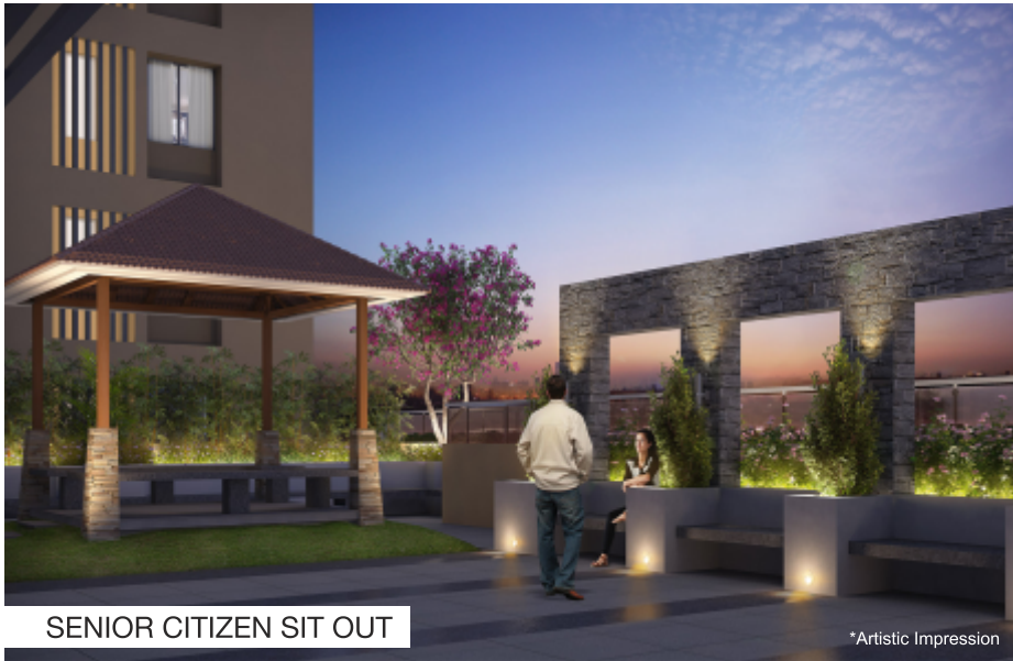
SENIOR CITIZEN SIT OUT