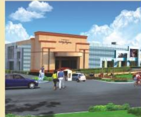
Vardhman SNG Plaza