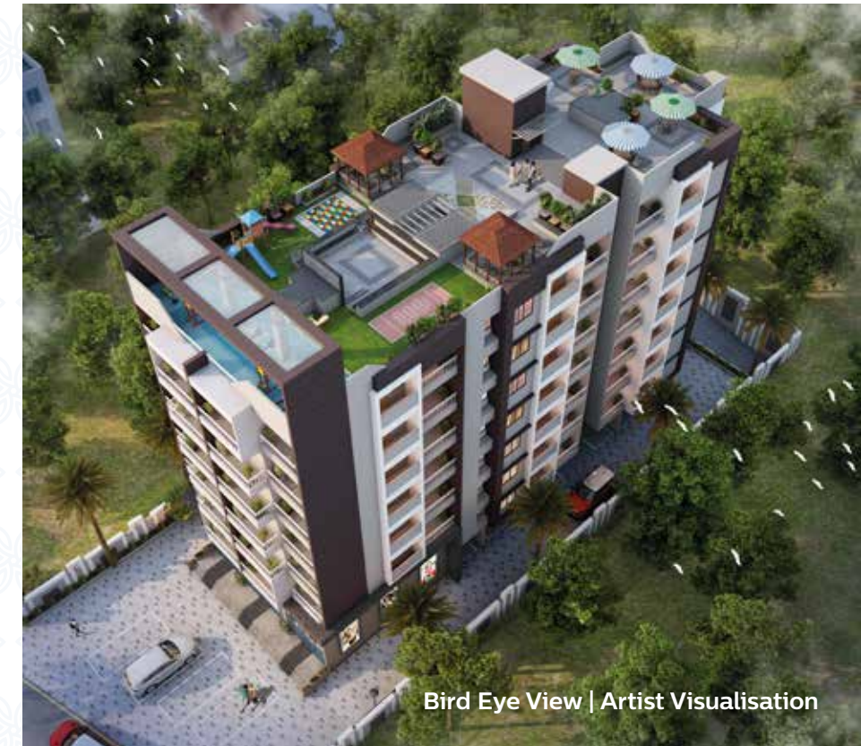
Bird Eye View | Artist Visualisation

Elevate your idea of relaxation and indulgence with the rooftop amenities area at Dolphin Garima. Perfect for bright mornings or starry nights, the roof top amenities space is designed for residents of all age groups with diverse likings. Have a cup of coffee at the pergolas or indulge in a game of snakes and ladders with your family; everything is just so accessible right above your home. Overlooking the city and with vistas so alluring, a home at Dolphin Garima is perfect to celebrate life, love and luxury on the roof top.