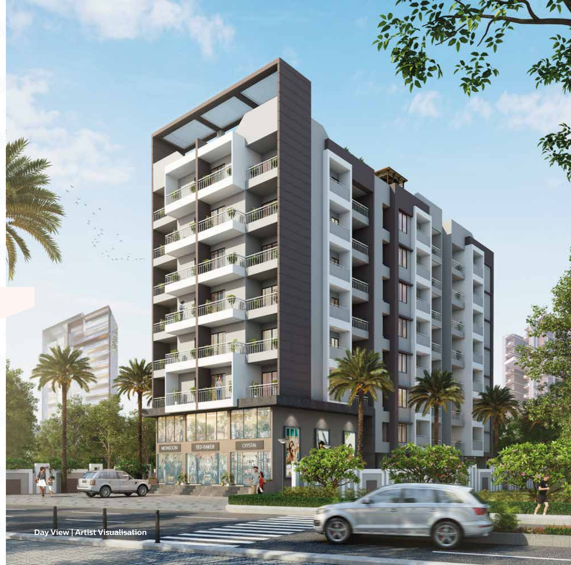
Day View | Artist Visualisation