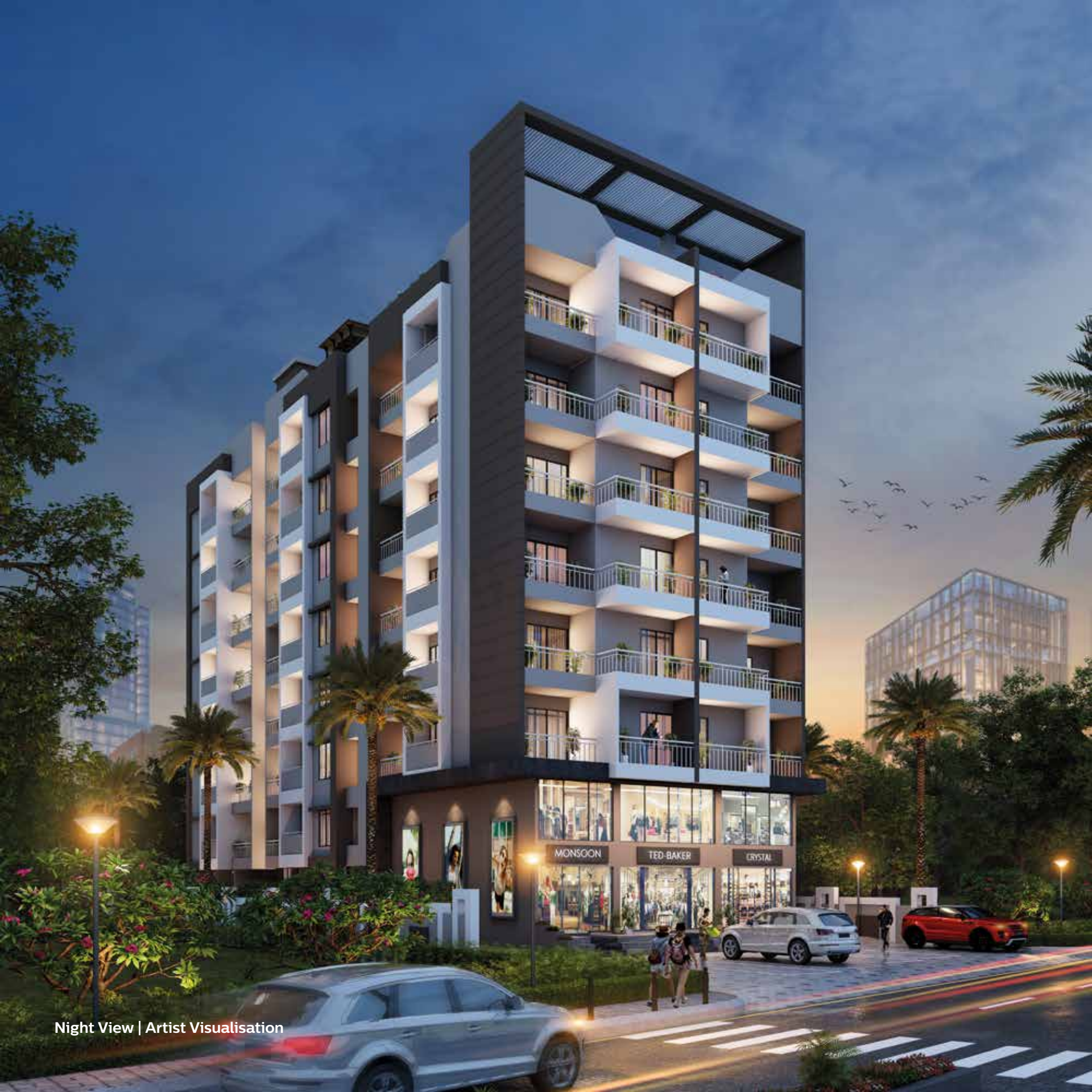
Night View | Artist Visualisation