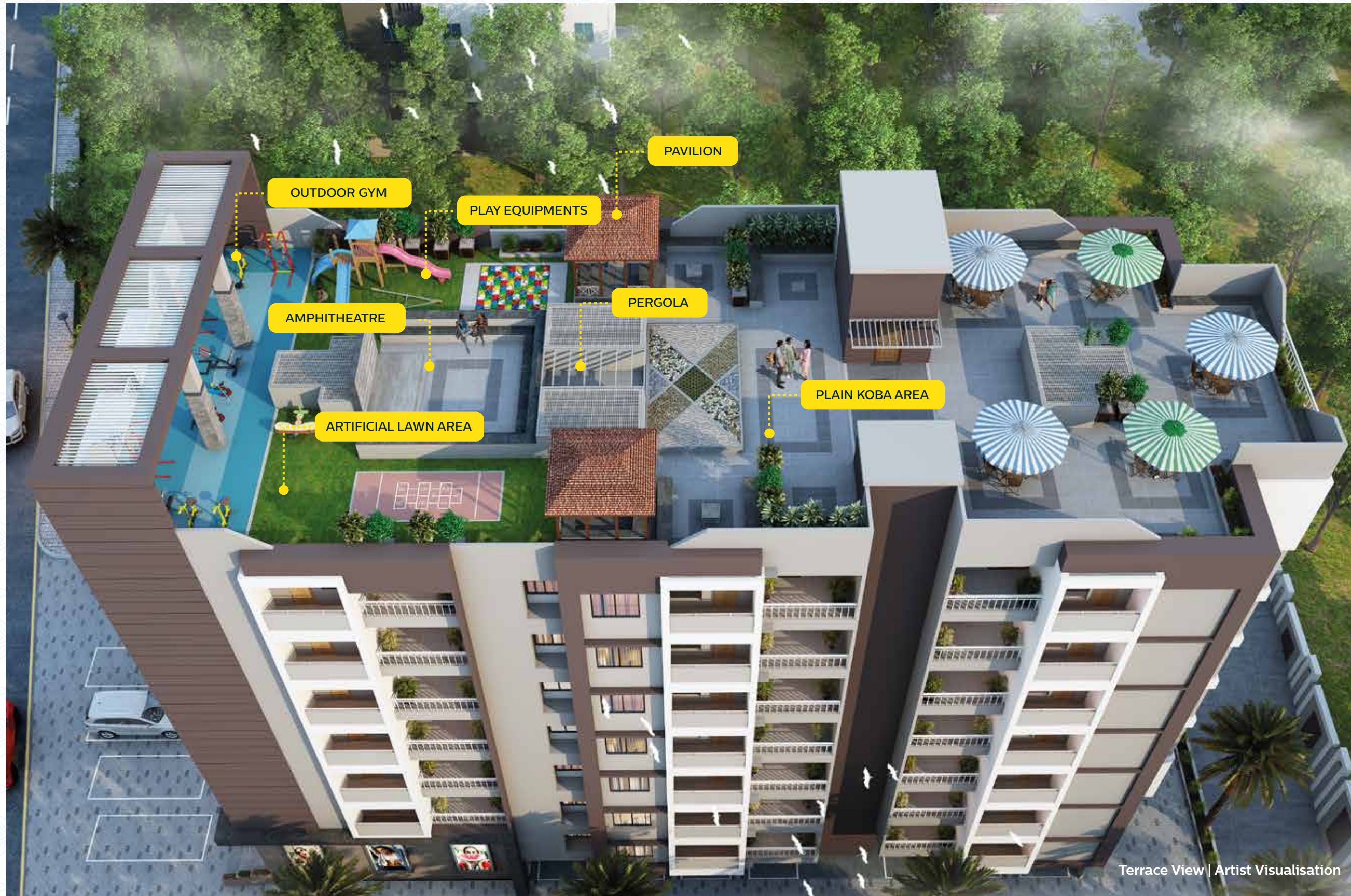
Terrace View | Artist Visualisation