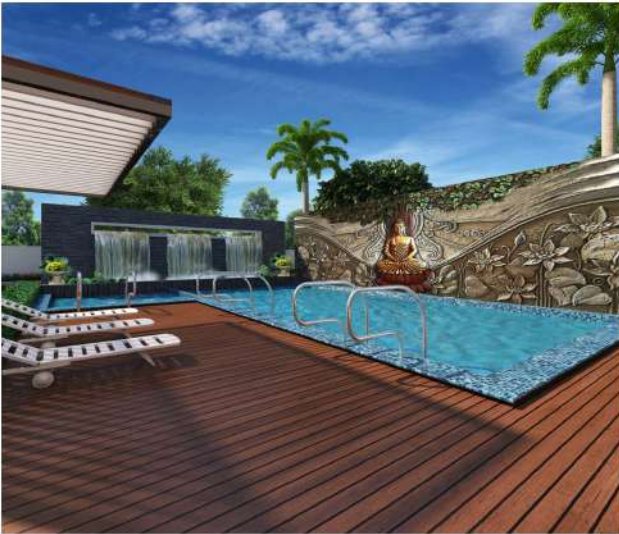
Resort-style pool and sundeck