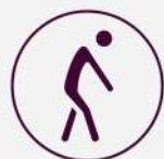
Sr. Citizen Park

Taking one step towards nature, we bring you the adorable landscapes, of the huge central lawns, that opens up the world of outdoor spaces to you. While the lush green area soothes your senses and calms your soul.