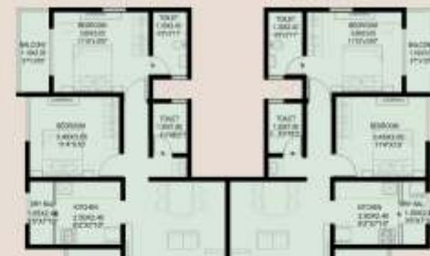
REFUGE FLOOR PLAN