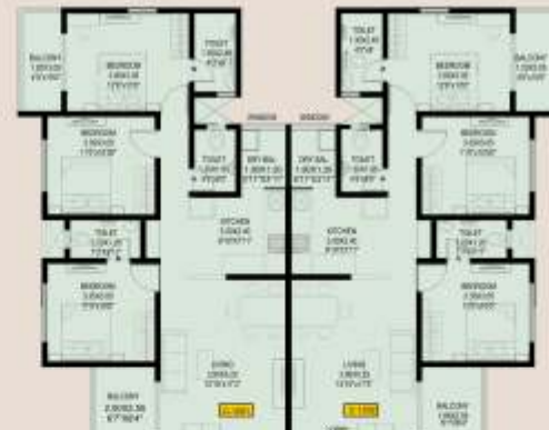
REFUGE FLOOR PLAN