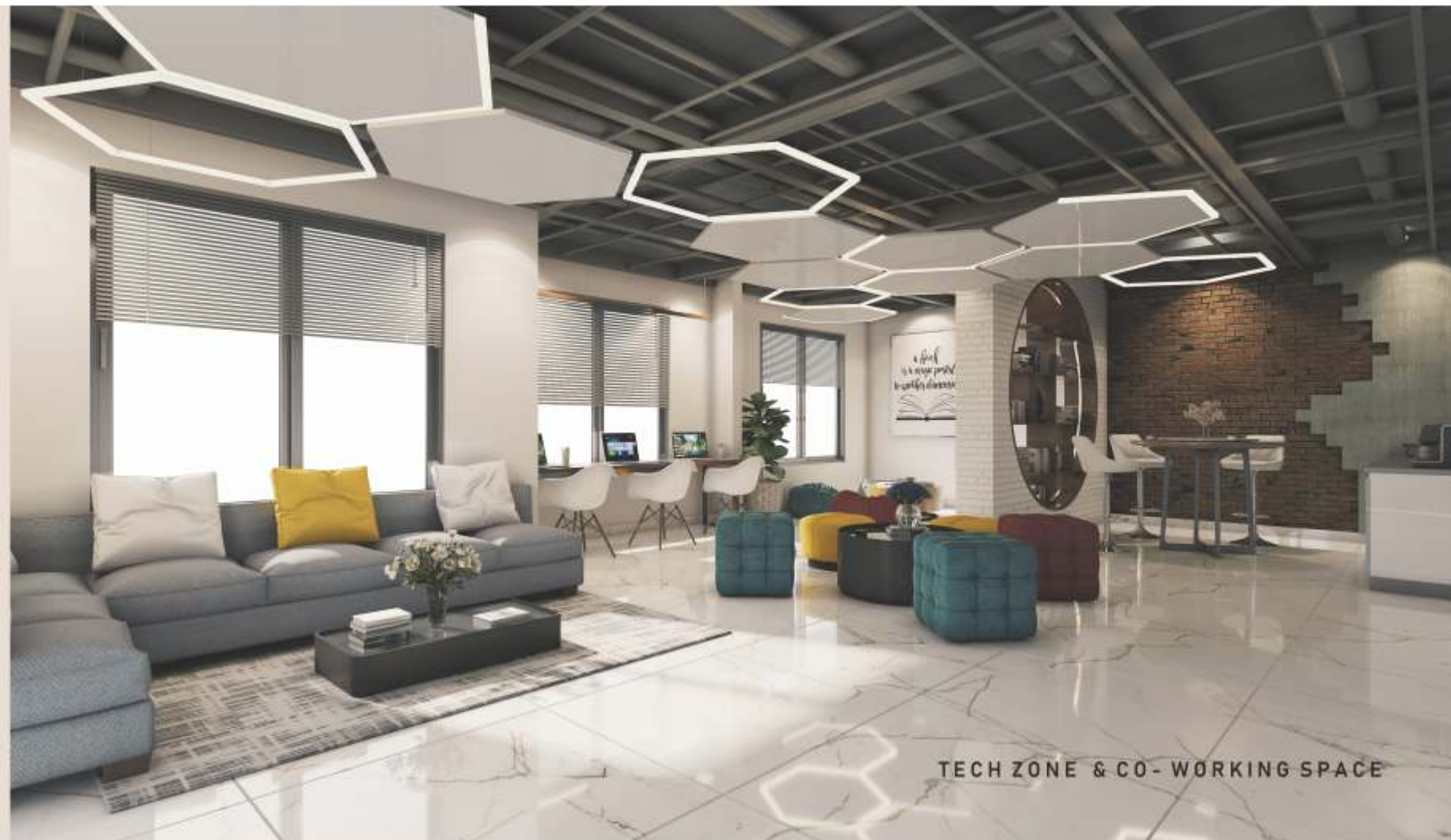
TECH ZONE & CO - WORKING SPACE