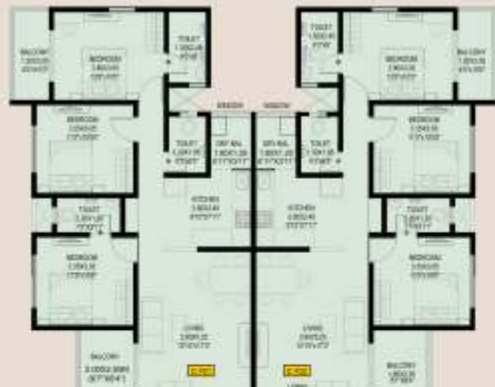
REFUGE FLOOR PLAN