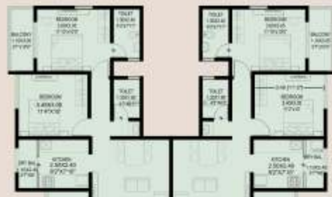
REFUGE FLOOR PLAN