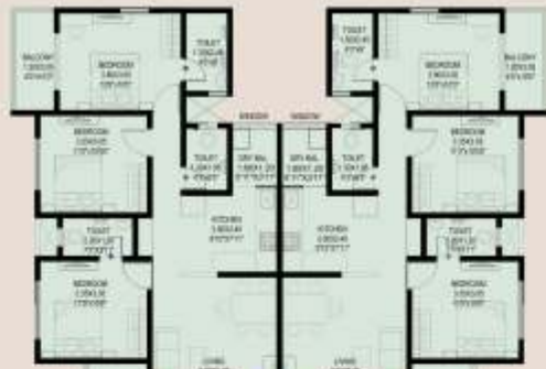
ODD FLOOR PLAN