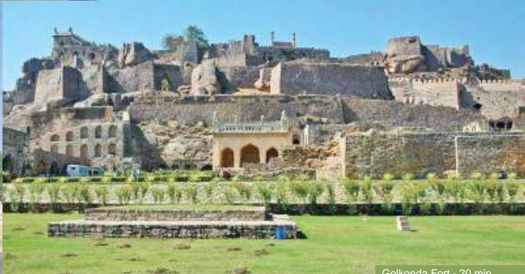
Golkonda Fort - 20 min