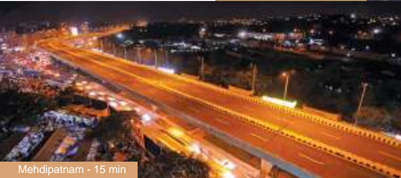
Mehdipatnam - 15 min