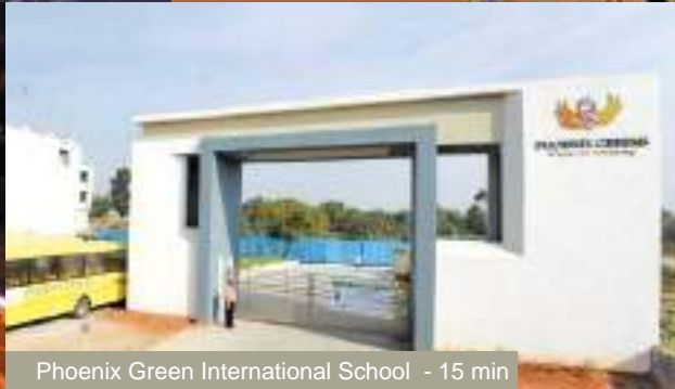
Phoenix Green International School - 15 min