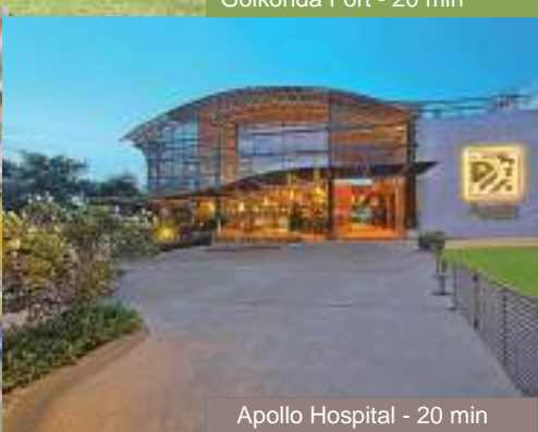
Apollo Hospital - 20 min