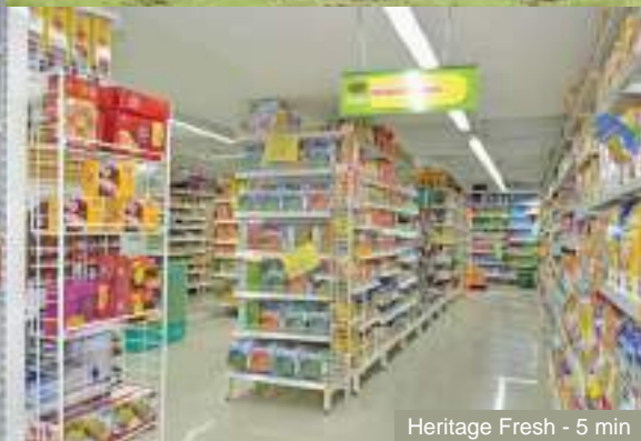
Heritage Fresh - 5 min