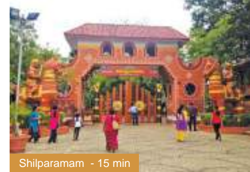
Shilparamam - 15 min