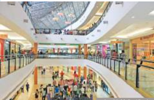
Inorbit Mall - 15 min