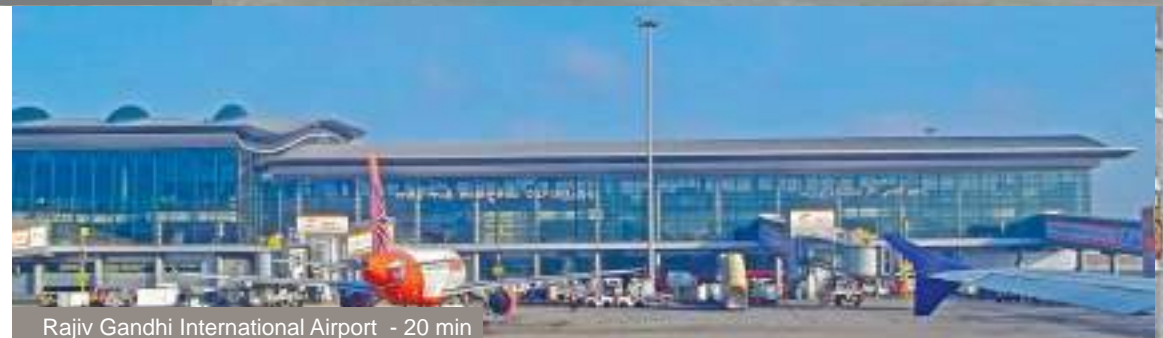
Rajiv Gandhi International Airport - 20 min