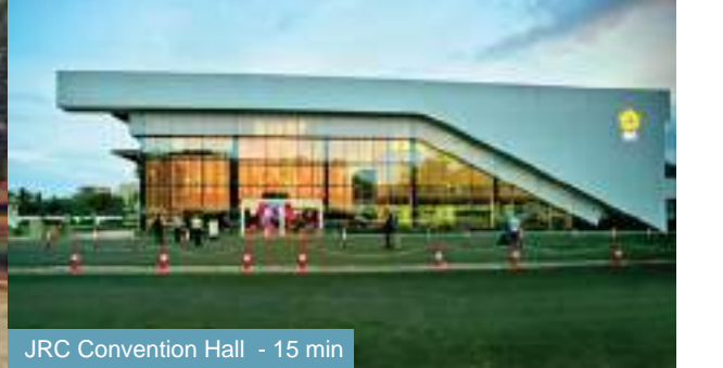
JRC Convention Hall - 15 min