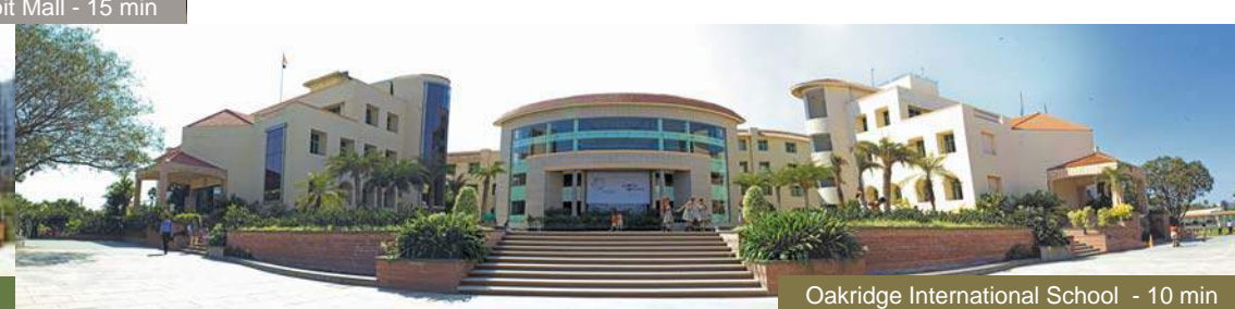
Oakridge International School - 10 min