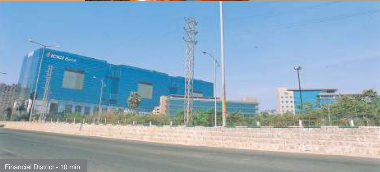
Financial District - 10 min

Silvanus is well-enveloped by many a landmark, thanks to the location it is set in. Its strategic location of Alkapur Township bestows it the advantages of being in real nearness to everything from places of national significance to places of local conveniences. Most destinations that matter to you will never be too far from here. That includes everything from Rajiv International Airport to hospitals, supermarkets and many more.