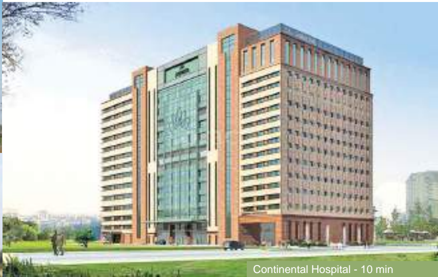
Continental Hospital - 10 min