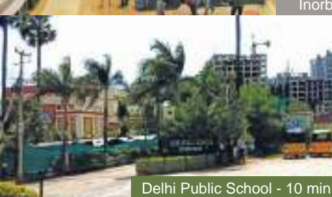
Delhi Public School - 10 min