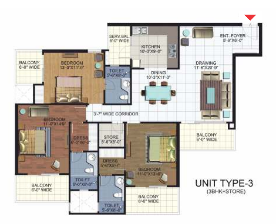
3 Bedroom 1970 sq. ft.