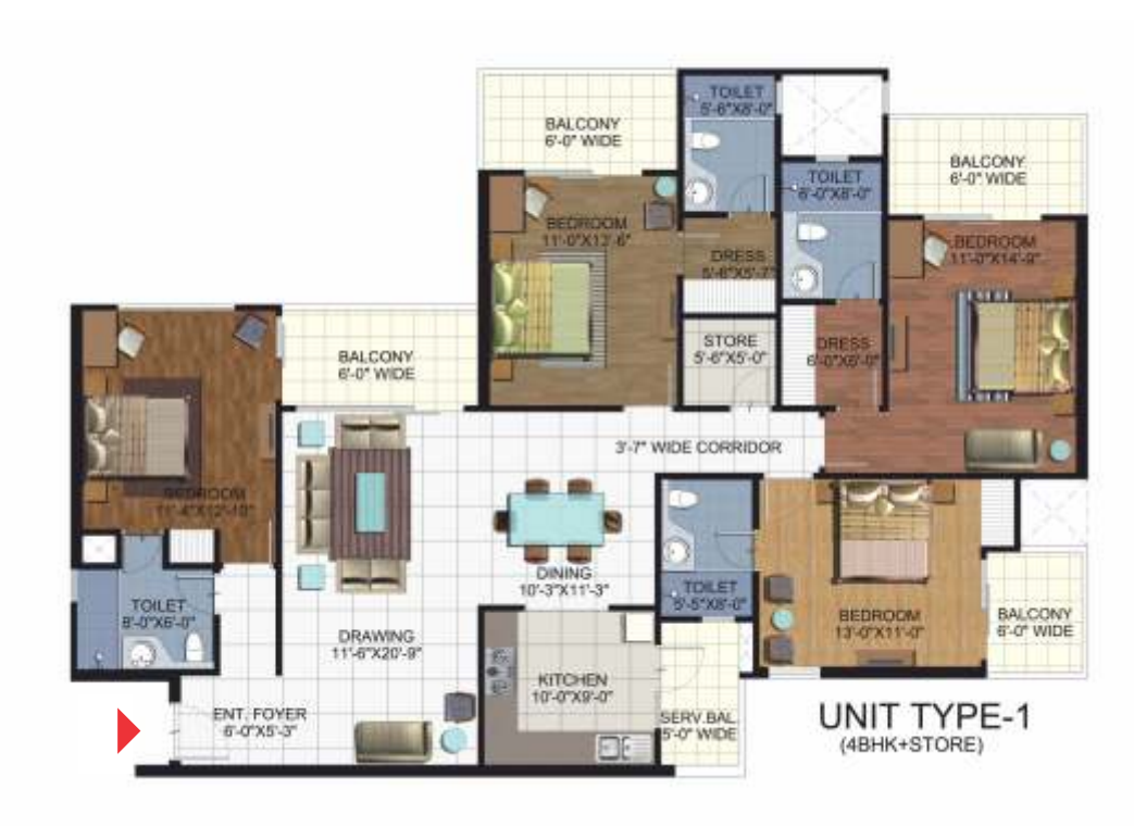
4 Bedroom 2270 sq. ft.