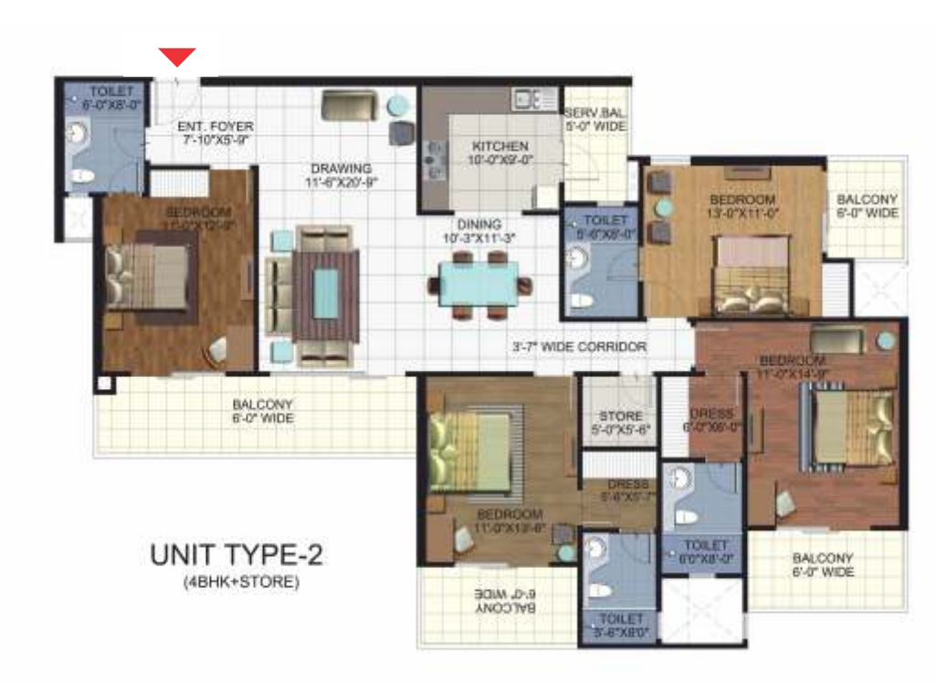
4 Bedroom 2320 sq. ft.