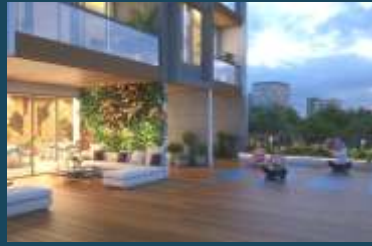
YOGA & MEDITATION CENTER