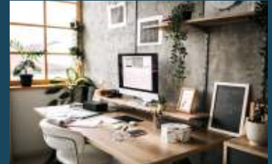
WORK FROM HOME AREA