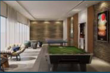
DEDICATED LUXURY INDOOR GAME SECTION