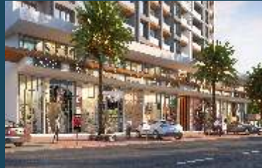
PREMIUM COMMERCIAL SPACES