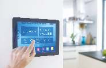
FUTURE READY SMART HOME