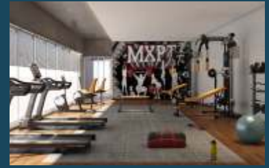
WELL EQUIPPED FITNESS CENTER