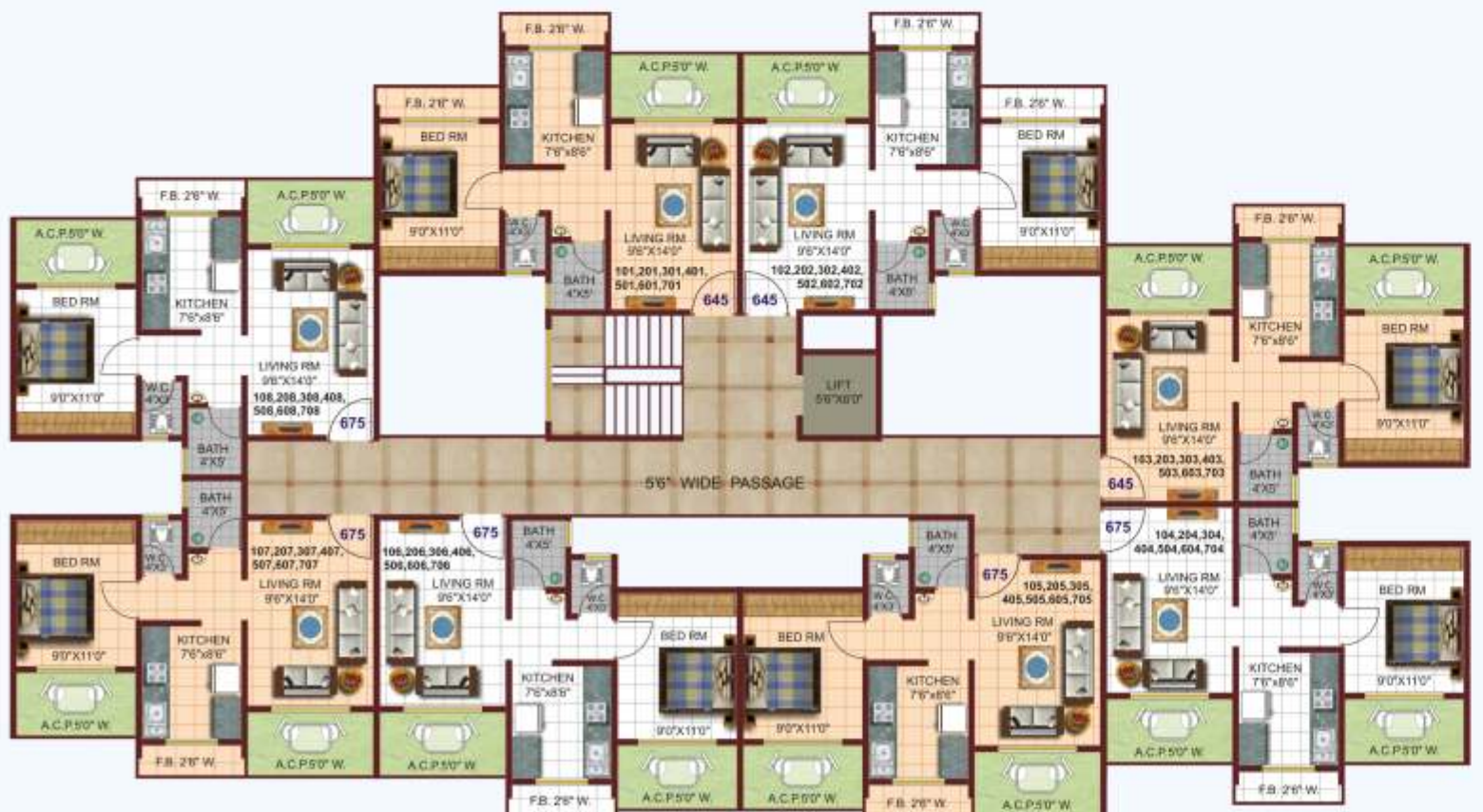
FIRST TO FIFTH FLOOR PLAN