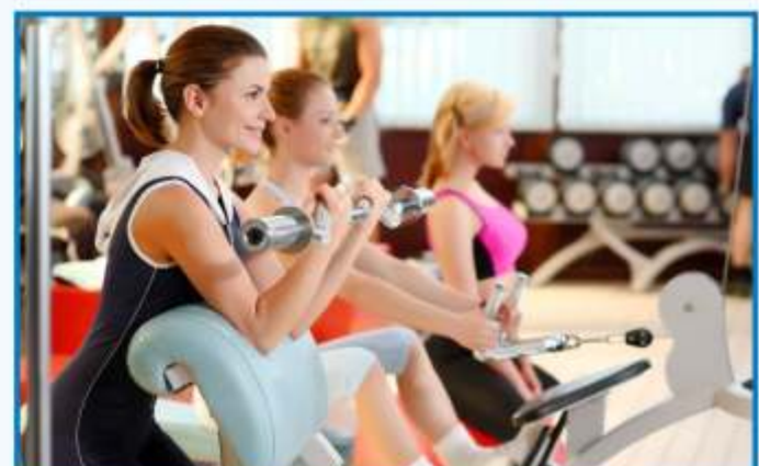
Health Club ( FREE Membership)