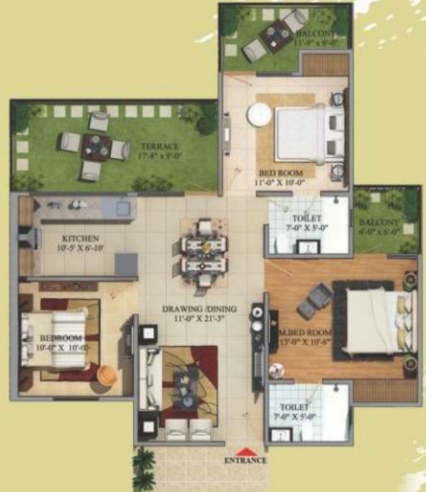
3 BHK + 2 Toilet Super Area = 1350 sq.ft.