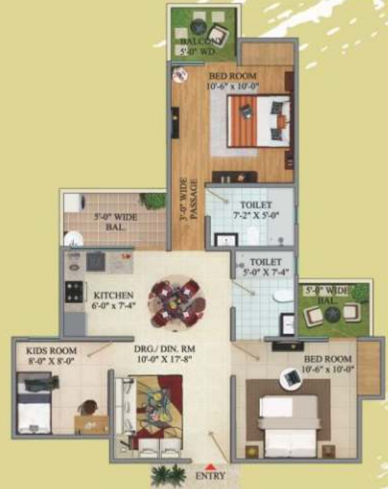
2 BHK + 2 Toilet + Kid's Room Super Area = 1095 sq.ft.