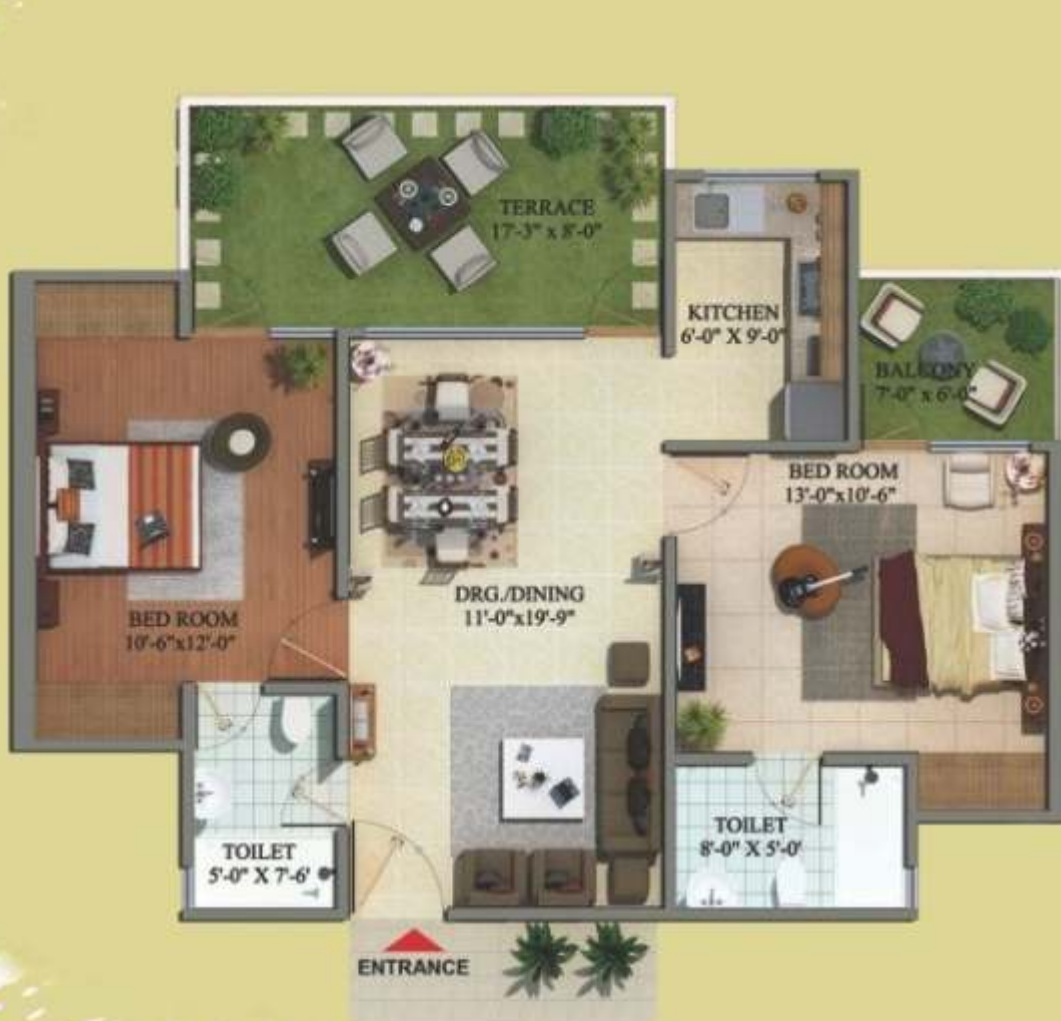
2 BHK + 2 Toilet + Terrace Super Area = 1275 sq.ft.