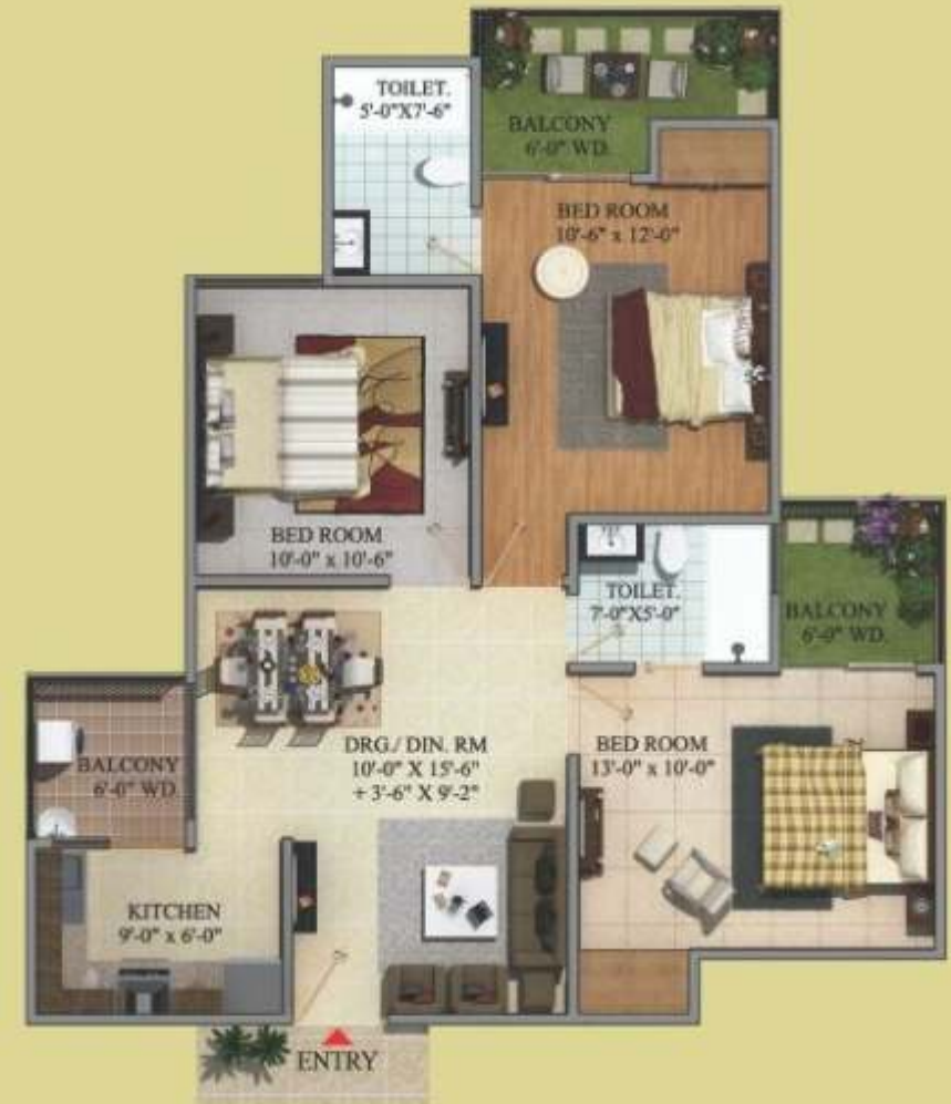
2 BHK + 2 Toilet Super Area = 1297 sq.ft.