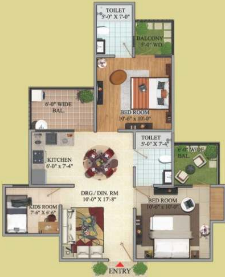
2 BHK + 2 Toilet + Kids Room Super Area = 1050 sq.ft.