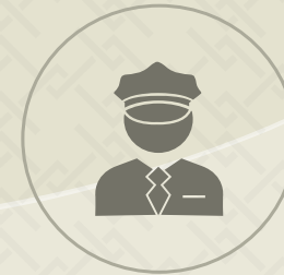
Security Cabin at Entrance Gate