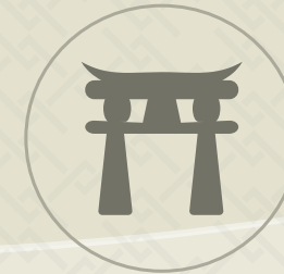
Attractive Entrance Gate for Society