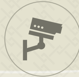
CCTV Surveillance for extra Security