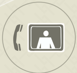
Intercom Facility for Extra Security