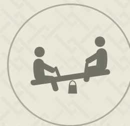
Kids Play Area