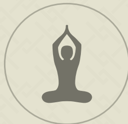
Activity Hall for Meditation / Yoga & Indoor Games