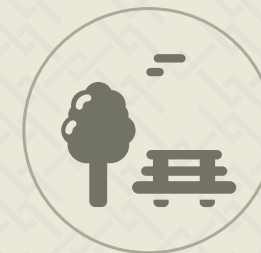
Senior Citizen Sit-out