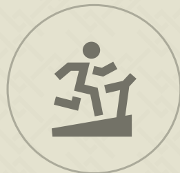
In-house Fitness Center with Gymnasium