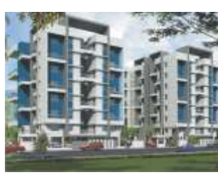
Uday Glorious Park