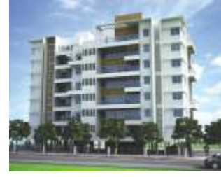
Shree Ganesh Heights