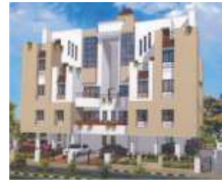
Uday Garden Residency