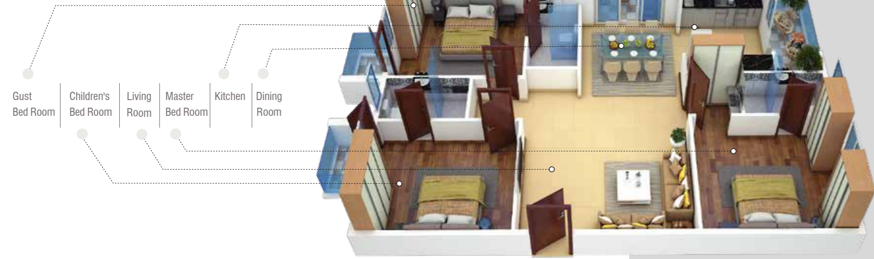
Isometric view WING - A, Flat no: 1 & 5