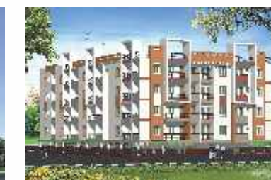
Rsun Whites @ Whitefields