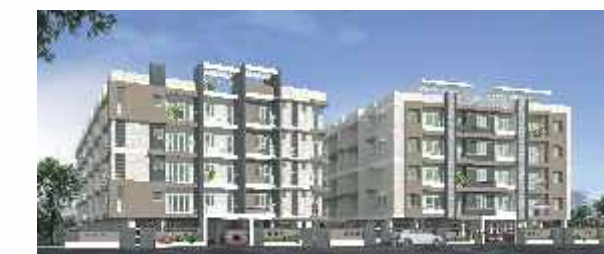
Rsun Palms @ Whitefields