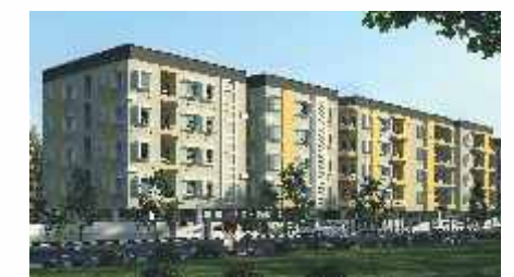
Rsun Sushmitham 1 @ Channasandra