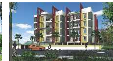
Elite Homes @ ITPL