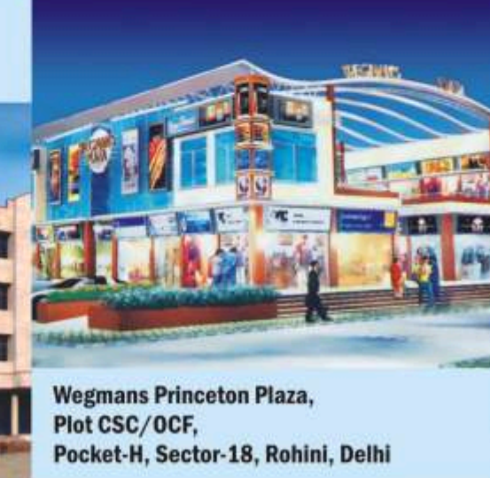
Wegmans Princeton Plaza, Plot CSC/OCF, Pocket-H, Sector-18, Rohini, Delhi