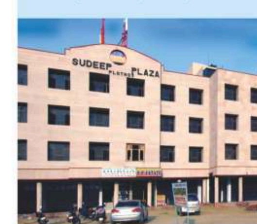
Sudeep Plaza, Plot No.3, Pocket-IV, Sector-11, Dwarka, Delhi