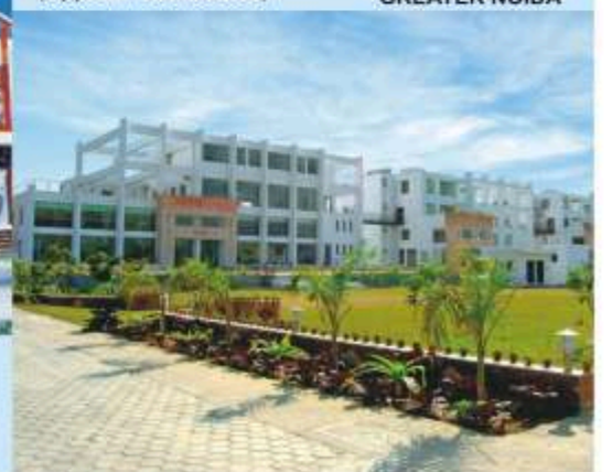
Tivoli Habitat Centre R-1, Sec. 20 Recreational Sector, Greater Noida (Opp. J.P. Golf Course)