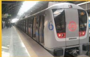
Walking distance from Metro