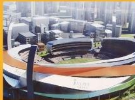
1 Km from Cricket Stadium