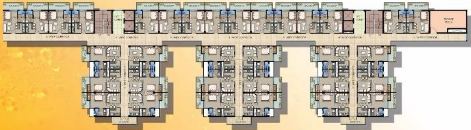
4TH FLOOR TYPICAL PLAN