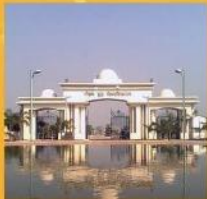
5 Km from Gautam Budh University