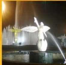
1.5 Km from Pari Chowk