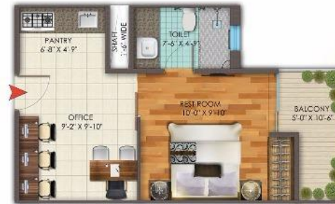
UNIT BIG WITH OFFICE- SUPER AREA 540 SFT