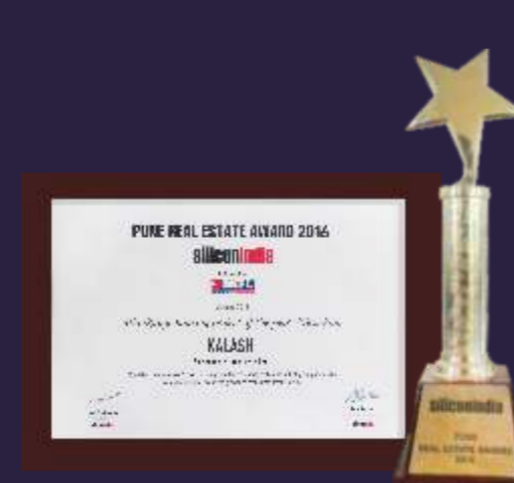
Best Mid-range project of the Year West Pune 2015-16