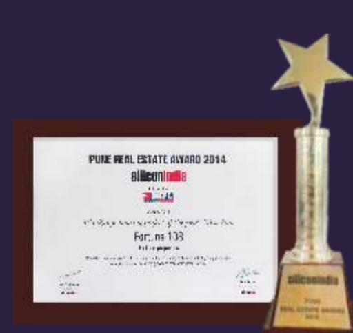
Best Mid-range project of the Year West Pune 2013-14