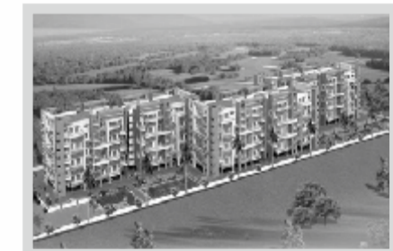
Solitaire Dhanori, Pune