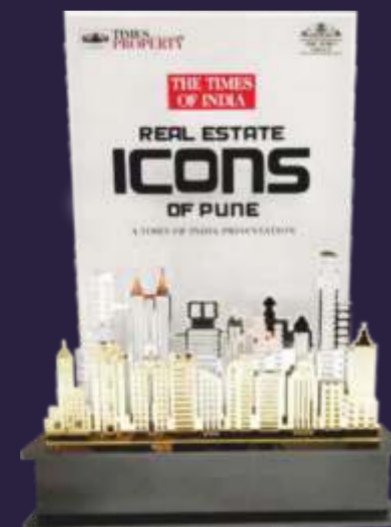
Real Estate Icon of Pune 2018-19