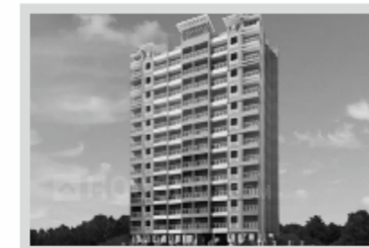
Sheetal Heights Mumbai