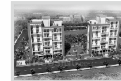
Fortune Mirador Baner, Pune