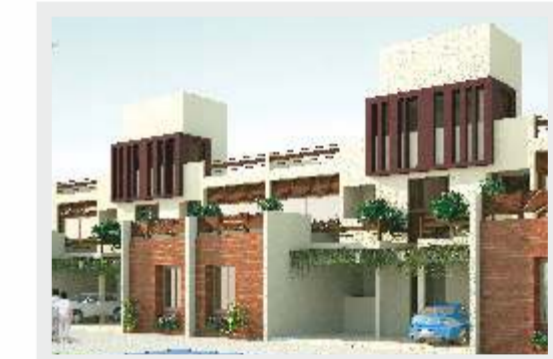
FORTUNE Brookland 1 & 2 BHK ROW HOUSES MALAWALI, LONAVALA