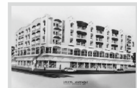
Sheetal Apartments Vapi, Gujarat