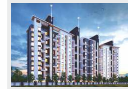
CHESTERFIELD EXCLUSIVE 2 BHK MOST SCENIC LOCATION DHANORI