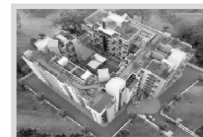
Fortune 108 Wakad, Pune