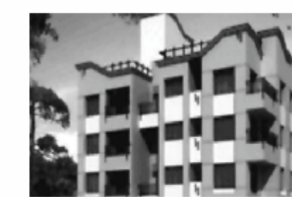
Orchid Dhanori, Pune