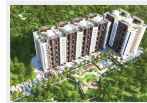
kalash 1 & 2 BHK MOST SPACIOUS FLATS PIRANGUT