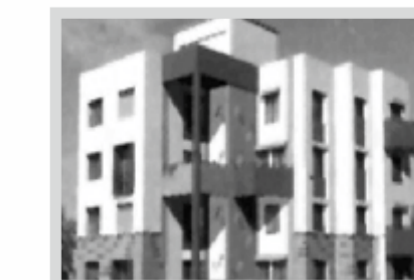
Iris Tingre Nagar, Pune