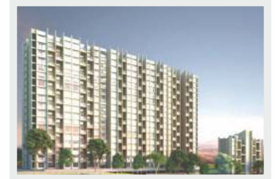
GANGA ACROPOLIS UBER LUXURY 2, 3, 3.5, 4 BHK & PENTHOUSE BANER ANNEXE