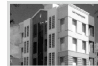
Sai Paradise Vishrantwadi, Pune