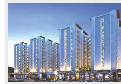
PANAMA PARK 1 & 2 BHK VALUE PLUS HOMES DHANORI NX