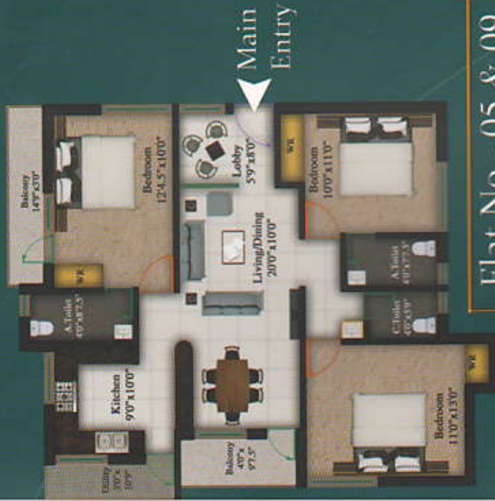
Flat No - 05 & 09