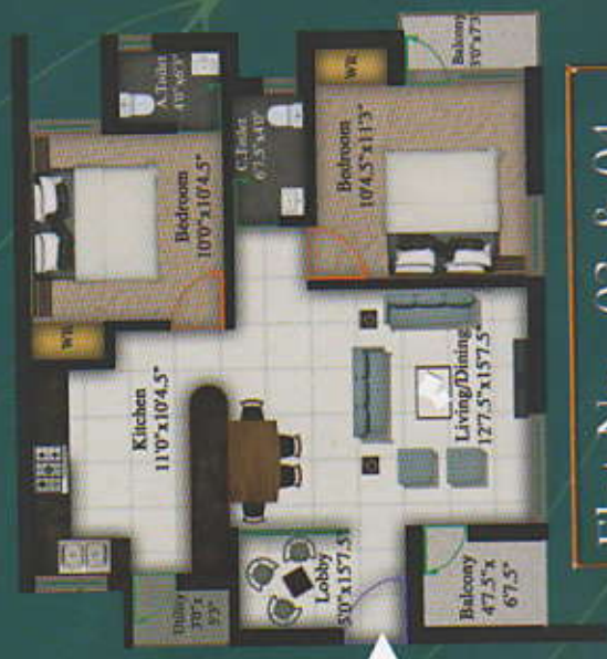
Flat No - 03 & 04