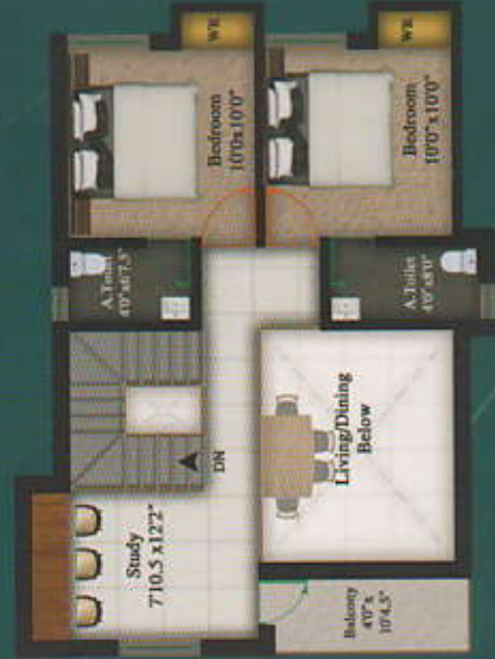
Flat No - 07