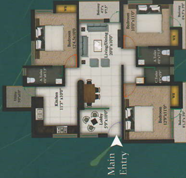
Flat No - 06 & 10