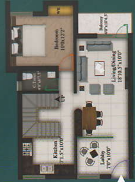
Level - 01