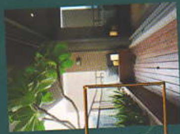
LUXURY LIVING SPACE

RHC & Shetty's Group is all set to introduce a new concept of modern Architecture with Indian Vastu and a Unique amalgamation of Residential Apartment.