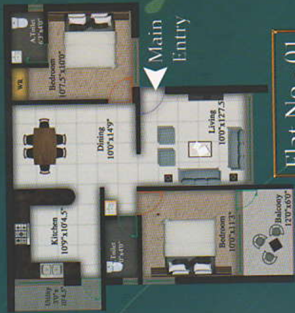
Flat No - 01