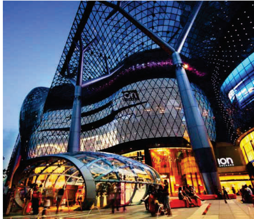
Ion Orchard, Singapore