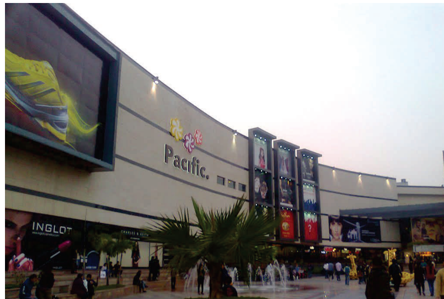
Pacific Mall, New Delhi, India