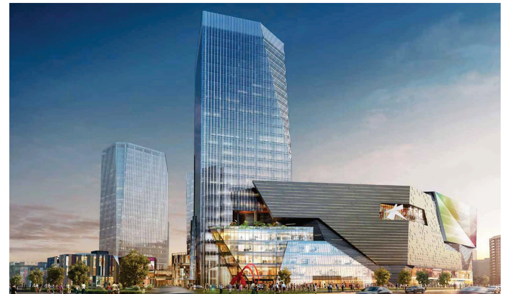
Joy City, Hangzhou, China