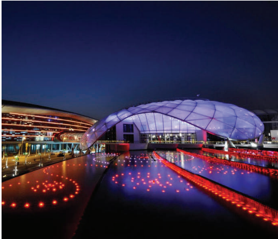
Ferrari World, Abu Dhabi, UAE