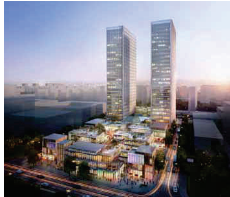
Qian Tan Office Park, Shanghai, China