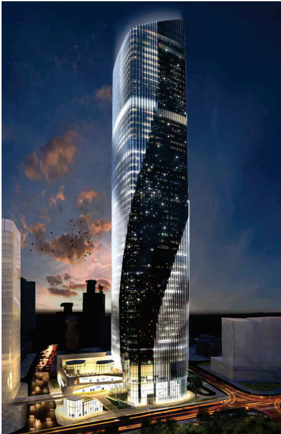
Ningbo New World, Ningbo, China