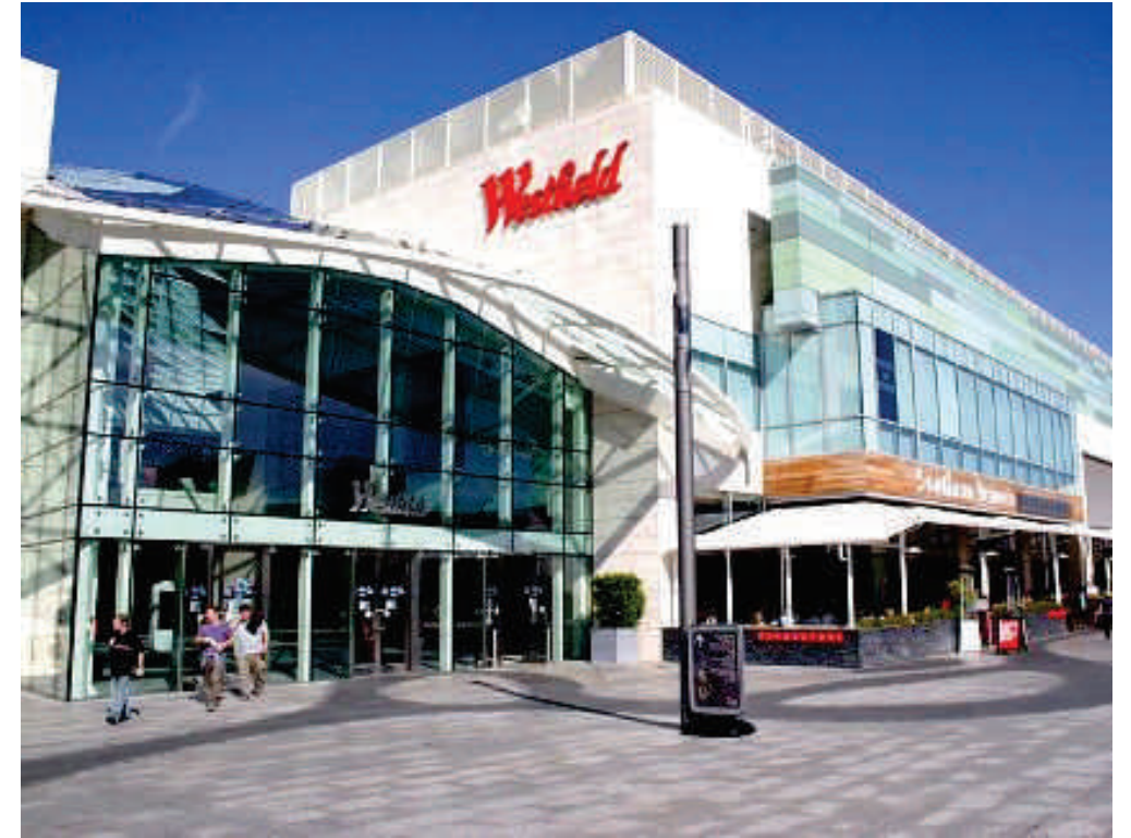
Westfield Mall, London