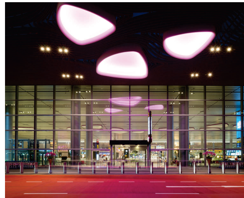
Changi Airport, Singapore