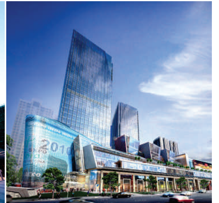
Shanghai ICC, Shanghai, China