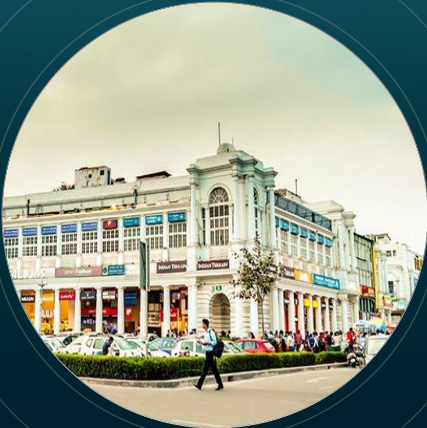
CANNAUGHT PLACE, DELHI