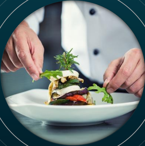
RESTAURANT & CAFE