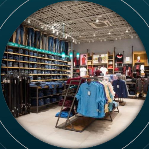
APPAREL CHAIN STORE