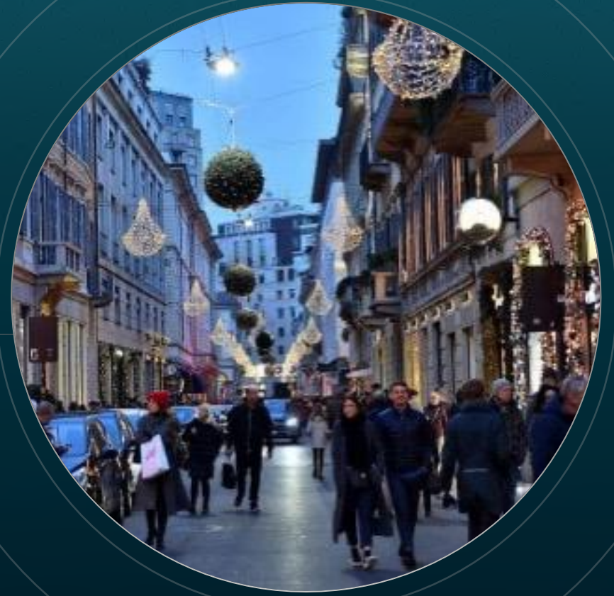
VIA MONTENAPOLEONE, MILAN