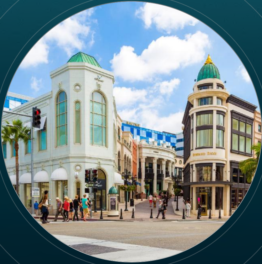
RODEO DRIVE, LOS ANGELES