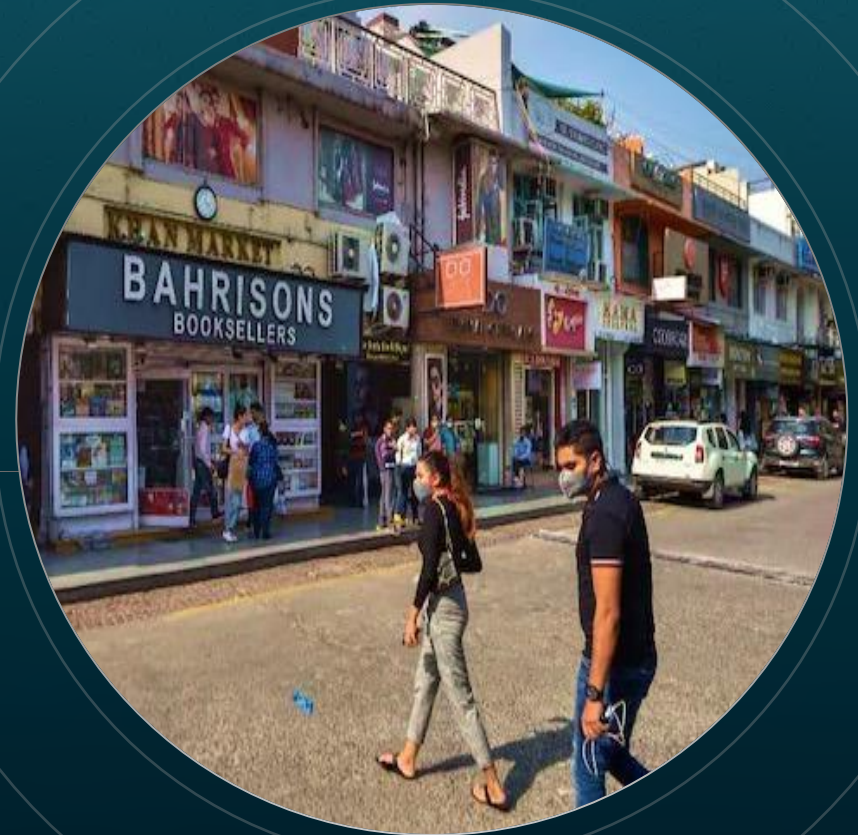
KHAN MARKET, DELHI