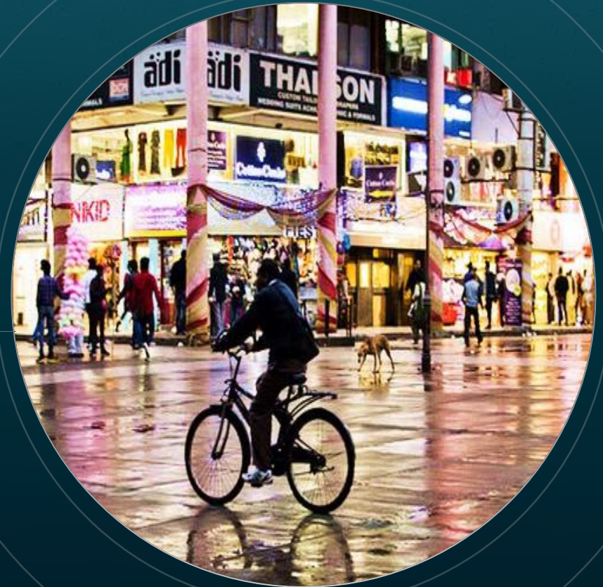
SECTOR – 17, CHANDIGARH