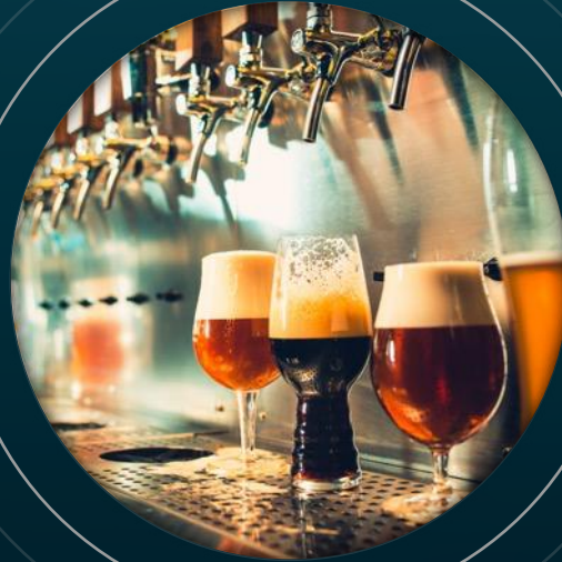
PUBS & CLUBS