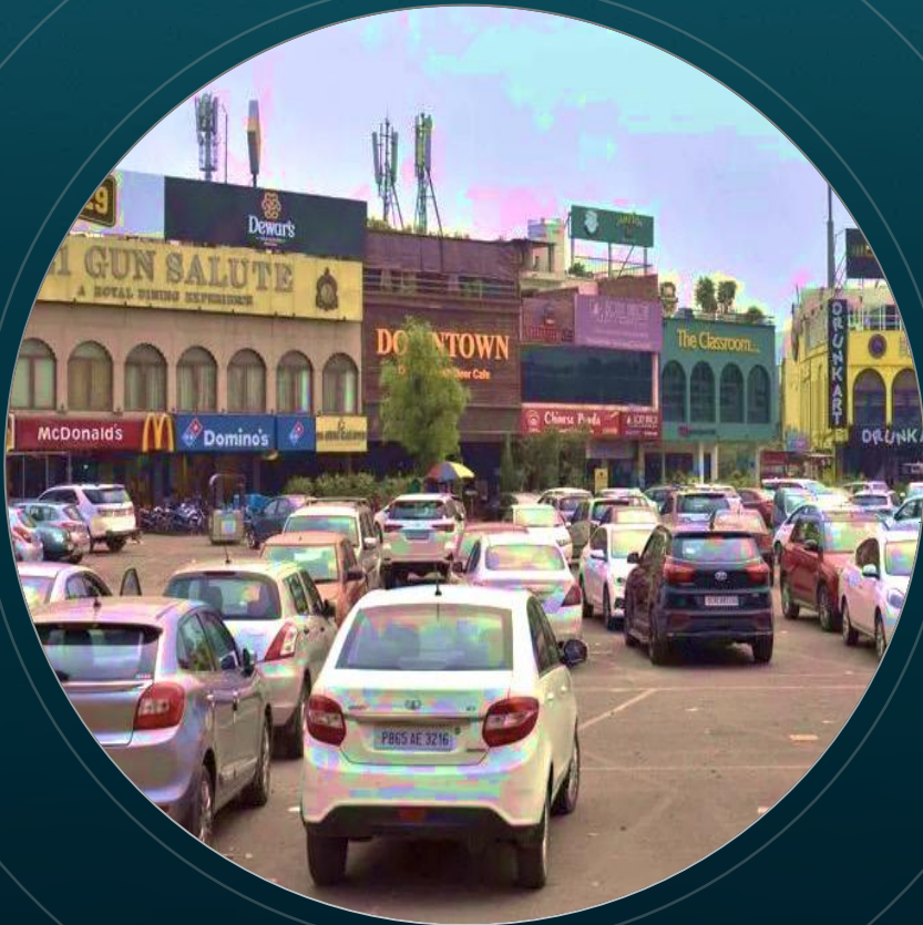
SECTOR – 29, GURUGRAM