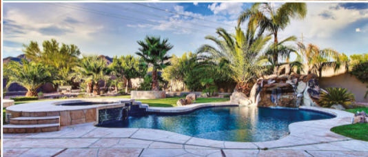
Actual photos of properties in the U.S. designed by Prime One Corp's founders.